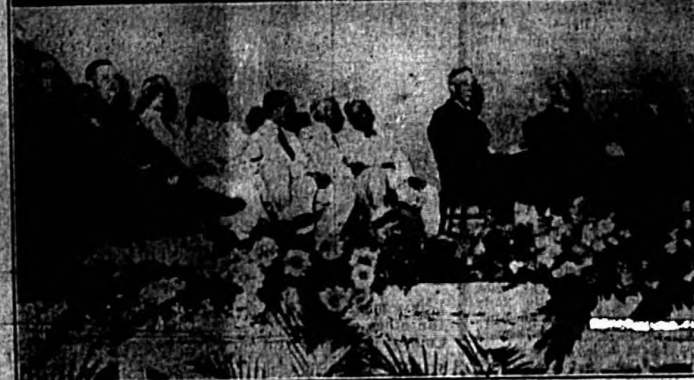
The body of United States Senator Duncan V. Fletcher lay in state in the rotunda of City Hall yesterday as thousands passed by the casket in final tribute to the senior member of the Senate, which he served for 27 years. Below, a group of Senatorial colleagues and State officials are shown on the stage of the Duval County Assembly at final rites were conducted.