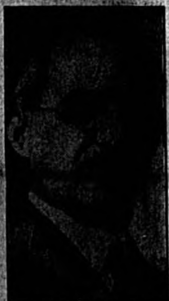
Fought with a national guard uprising against his administration, President Juan B. Secom (above) of Nicaragua took refuge in his palace at Managua and held out against the rebels with the aid of his body guard.