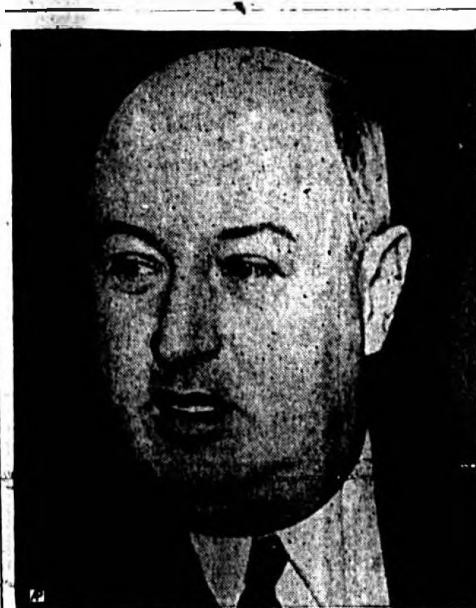
James A. Farley, postmaster general, and chairman of the Democratic National Committee, is holding the biggest convention of his life in Philadelphia, where he expects to nominate President Roosevelt almost by acclamation and start his ball rolling for another landslide in November.

Continuation Of New Deal Is The Issue, Says Chairman Of Party In Opener