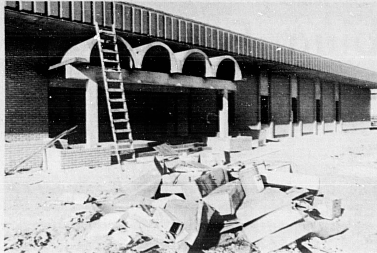
ENTRANCE of Altamonte Springs' new city hall faces on City Hall Street, a one block long new road being built by the city. City staff is expected to move into the structure which cost $362,000 either the weekend of April 7 or 14. The parking lot and new road will be paved sometime thereafter.