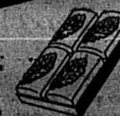
Royal Oak Bath Soap, gift set of four items, $2.50

These impressive new toiletries for men are deftly fragrant with a subtle, bracing scent as exhilarating as mountain air at sunrise. And fittingly complementary are Royal Oak's strikingly modern containers. Masterly combinations of pickled oak and glass enhance these requisites for men handsomely... truly make Royal Oak a thoughtful, personal gift.