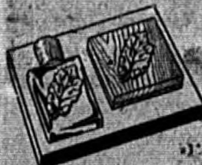
Royal Oak Shaving Cream and After-Shave Lotion gift set, $5