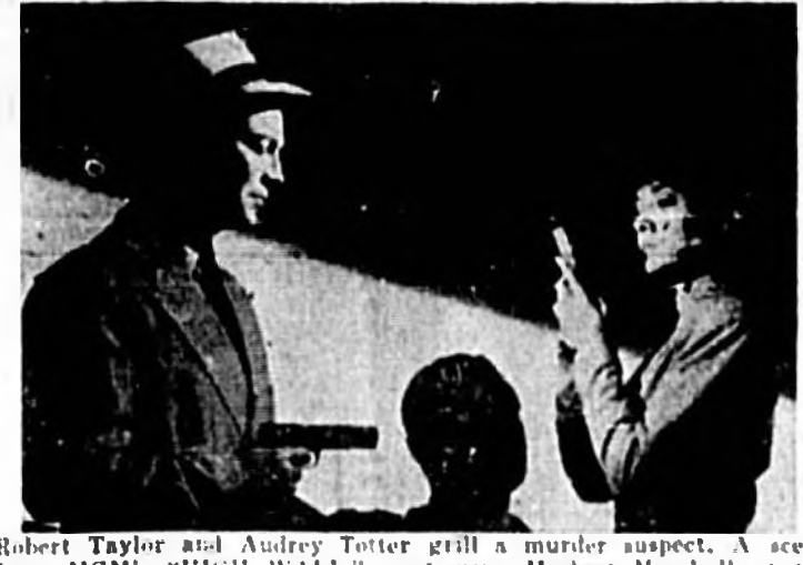
Robert Taylor and Audrey Totter grill a murder suspect. A scene from MGM's "HIGH WALL," co-starring Herbert Marshall at the Ritz Theater Tuesday and Wednesday.