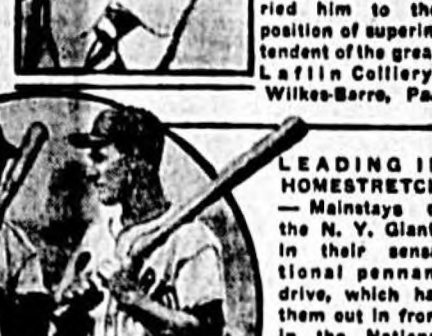
LEADING IN HOMESTRETCH —Maintains the N. Y. Giants in their sensational pennant drive, which has them out in front in the National League race, are Jimmy Ripple, left, who has been batting .350, and Mel Ott, .327.