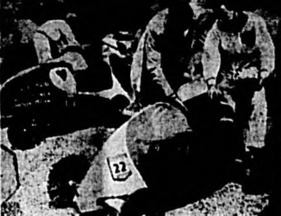
BOY RACERS COMPETE —Local champions in the All-American Soap Box Derby line up their fast home-made racers for the finals at Akron. One contestant tells an official about his home-made mohair velvet seat cushion, with which he hopes to win the cup for the best-upholstered car, even if he doesn't win the speed trials.