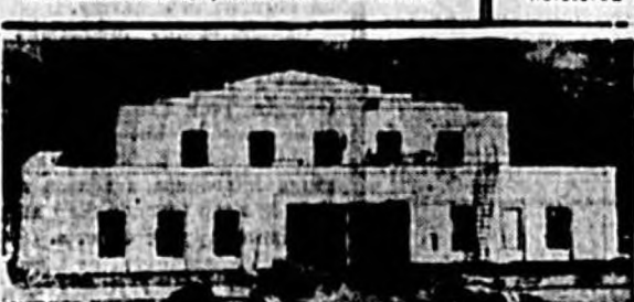
UNCLE SAM'S STRONG BOX —Six billion dollars in gold will start pouring into this treasure vault this month when fifty armored trains move the U. S. Treasury's gold reserve here. The granite vault, located at Fort Knox, Ky., is considered impregnable, with "electric eyes" and similar scientific devices to guard the treasure.