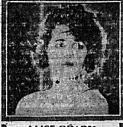
ALICE BRADY "THE DEATH DANCE" SELECT PICTURES