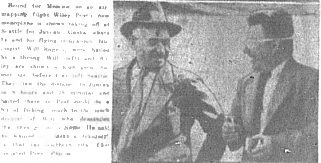
Four Nations Invited To Naval Parley

Four Nations Invited To Naval Parley Possible Agreement In Limitations To Be Discussed At Meet In October WASHINGTON, Aug. 16.—(AP)—The United States government announced today that it had invited the United Kingdom, France, Italy and Japan to a naval conference in London in October. The conference is expected to discuss limitations on the size and armament of naval vessels.