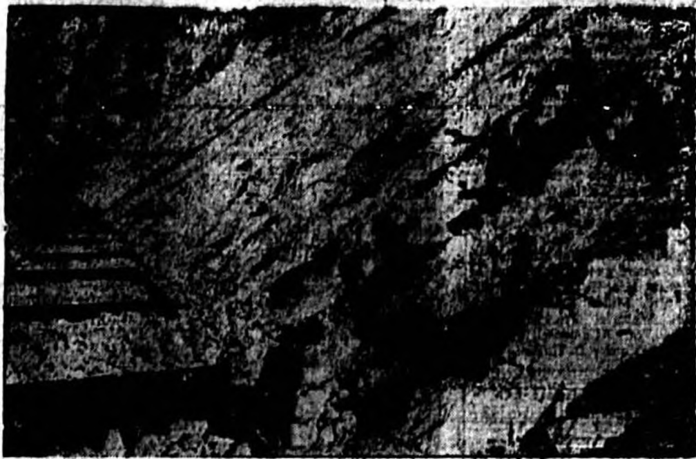
Tons of chalk are needed for the rebuilding of the docks at Southampton, England. It is dug out of the cliffs at Micheldeven, Hampshire and, transported by rail to Southampton. The cliffs are very steep and the men have difficulty in getting footholds while breaking away the chalk.