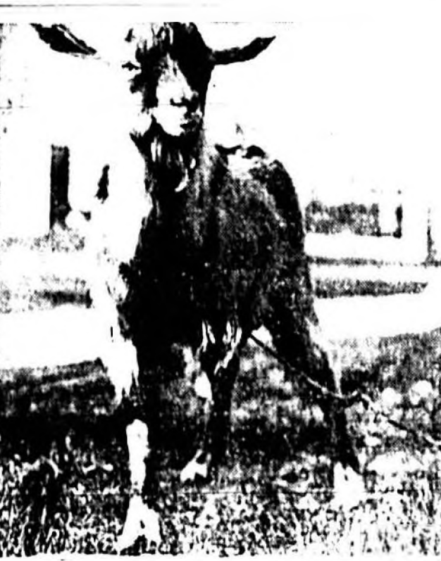
INGLEWOOD, Cal. Here is a goat that is born with only three legs. It is healthy and is doing well.