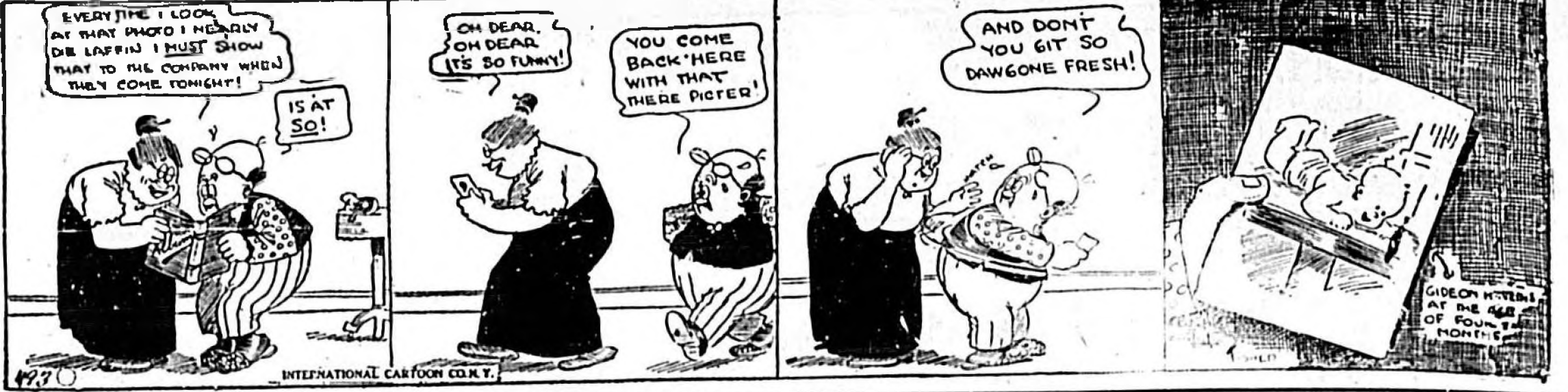
Raising the Family- You really can't blame Gideon for feeling that way!

Distributors for Seminole, Lake, Osceola and Volusia Counties