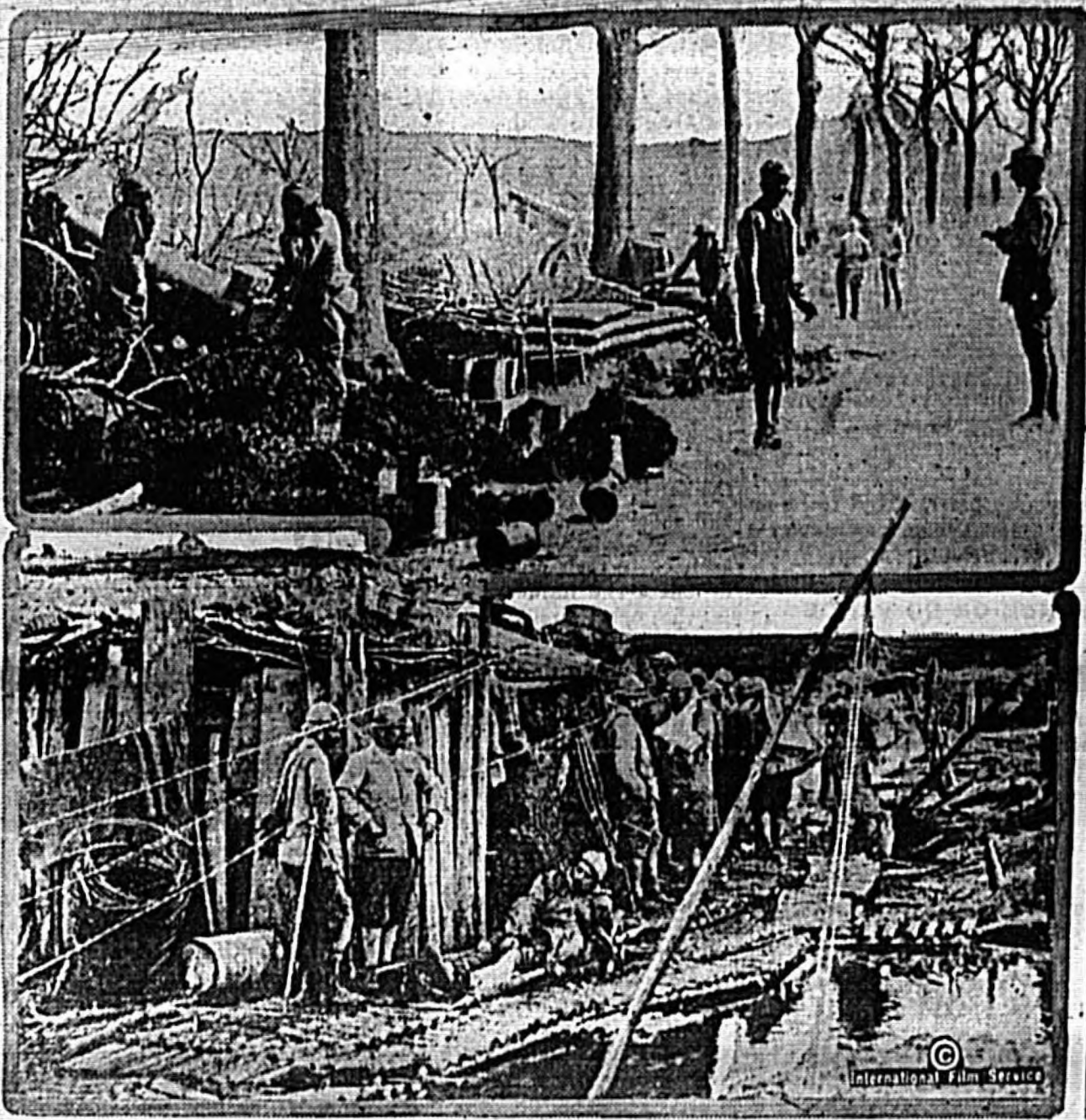
The illustration shows a French heavy artillery battery in action in the Somme sector, and a French dressing station immediately in the rear of the fighting line in Flanders.