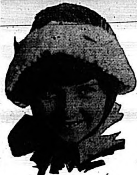
BABY MARIE OSBORNE in "Daddy's Girl" At the STAR SATURDAY

They are simple in plot and built around the child. They are distinctly different from any other pictures. They are Baby Osborne, first, last and all the time.