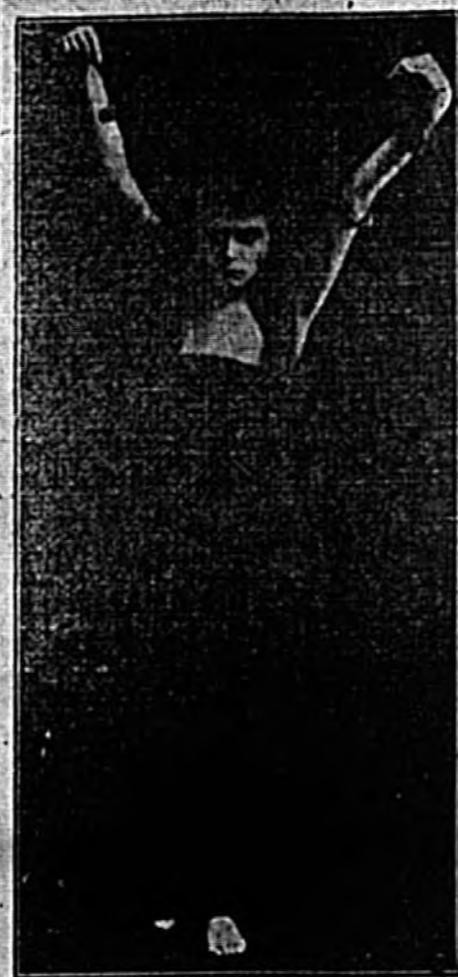
Theda Bara in "The Forbidden Path" At the Star Monday

Mary goes out with Sinclair. It is the story of so many working girls. He promises to marry her. But he does not. She seeks refuge among the very dogs of the populace.