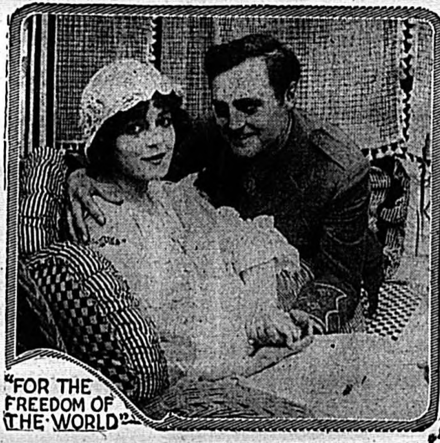
"FOR THE FREEDOM OF THE WORLD"

Be Diligent. Let everyone that hath a calling be diligent in pursuance of his employment, so as not lightly or without reasonable occasion to neglect it.—Jeremy Taylor.