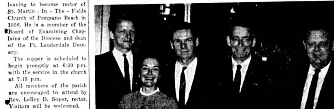
Fidelis Class Has Meeting