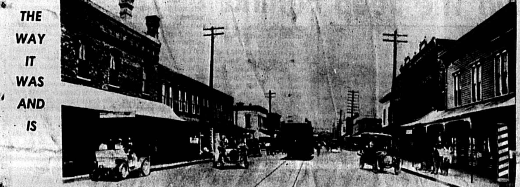
THE WAY IT WAS AND IS. A main drag in a main drag, right? Well, sort of. Check, for instance, the changes in Sanford's First Street (1916, above; 1977, below). Today would be a good day for the check, as the city marks its official 100th birthday.