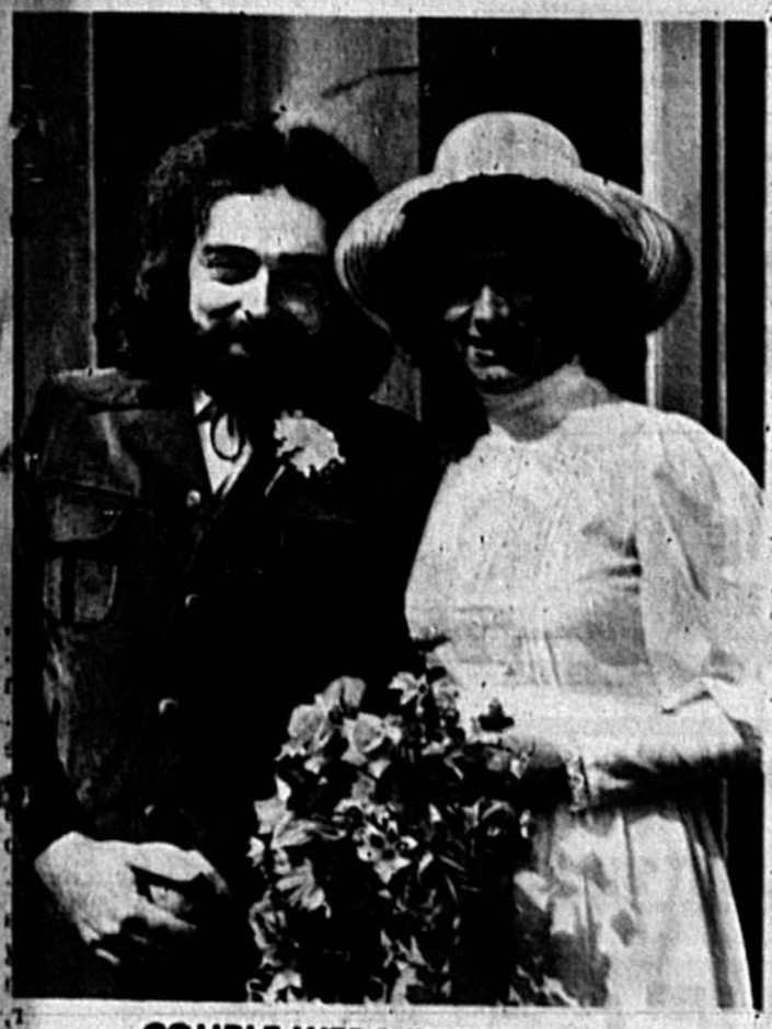
COUPLE WEDS IN SCOTLAND