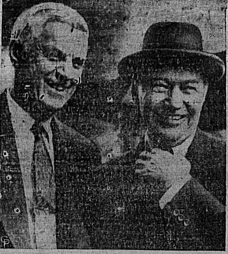
ARRIVING AT THE British Board of Trade in London are William L. Clayton (left), U. S. Under-Secretary of State for Economic Affairs, and Lewis Douglas, U. S. Ambassador to Britain. They conferred with Sir Stafford Cripps, Board of Trade president, about the dollar situation on which England blames much of her troubles.

That, then, is the Shangri-La for all male movie stars. Each