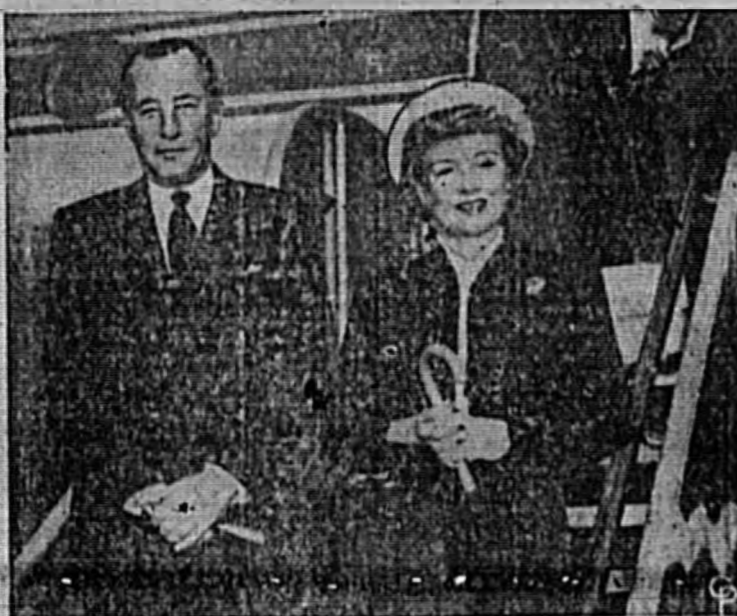
BRITISH AMBASSADOR to the United States, Lord Inverchapel and his Chilean-born wife, are shown on their arrival at LaGuardia Field, N. Y. Divorced in 1945, after 17 years of marriage, the Inverchapels were remarried a few days ago in Edinburgh, Scotland. The British envoy left for Washington to join loan conference.