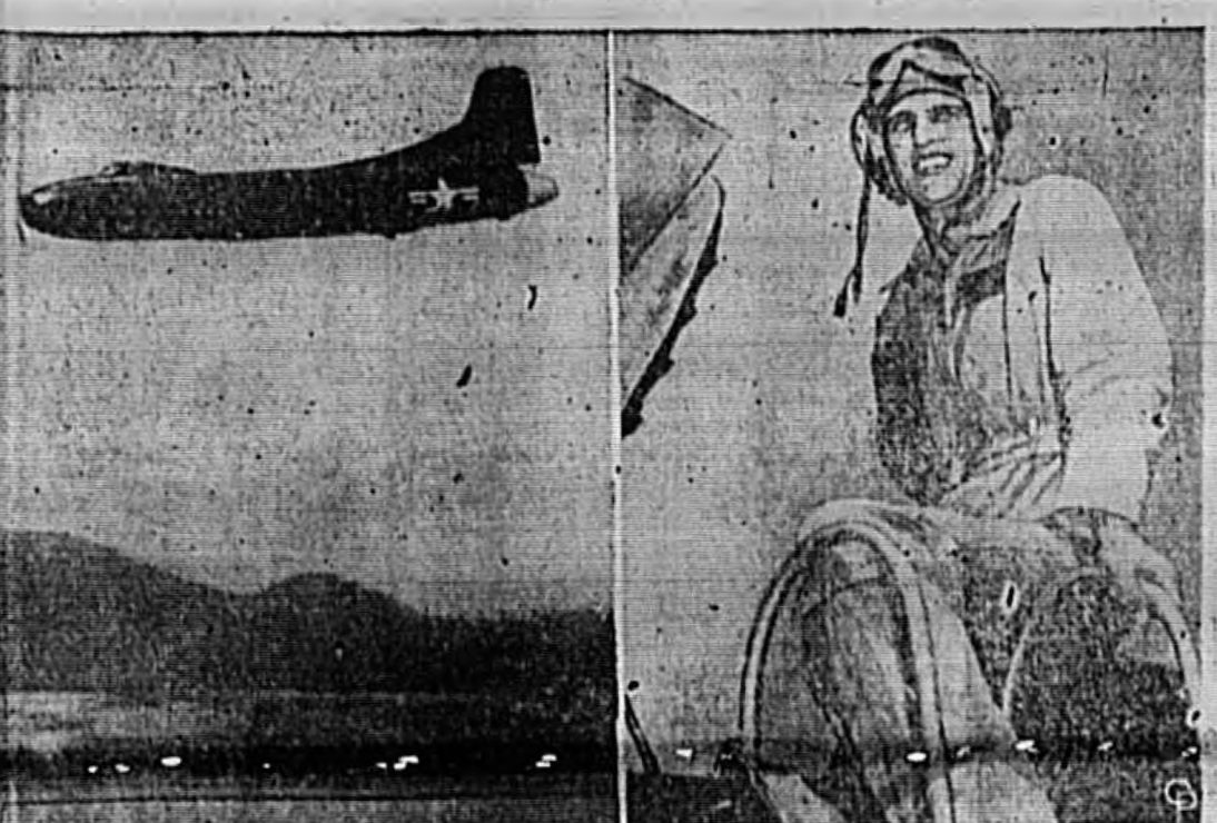
FLYING ACROSS THE MURCO ARMY AIR BASE, CALIFORNIA, at 650.8 miles an hour (nearly 11 miles a minute), the jet-engined Skyrocket (left) breaks the world's air-speed record set five days previously by the Navy in the same ship, Marine Maj. Markon E. Carl, 31, of Hubbard, Ore., who flew the record-breaking plane, is shown getting out of the stubby-winged craft (right) after the record flight.