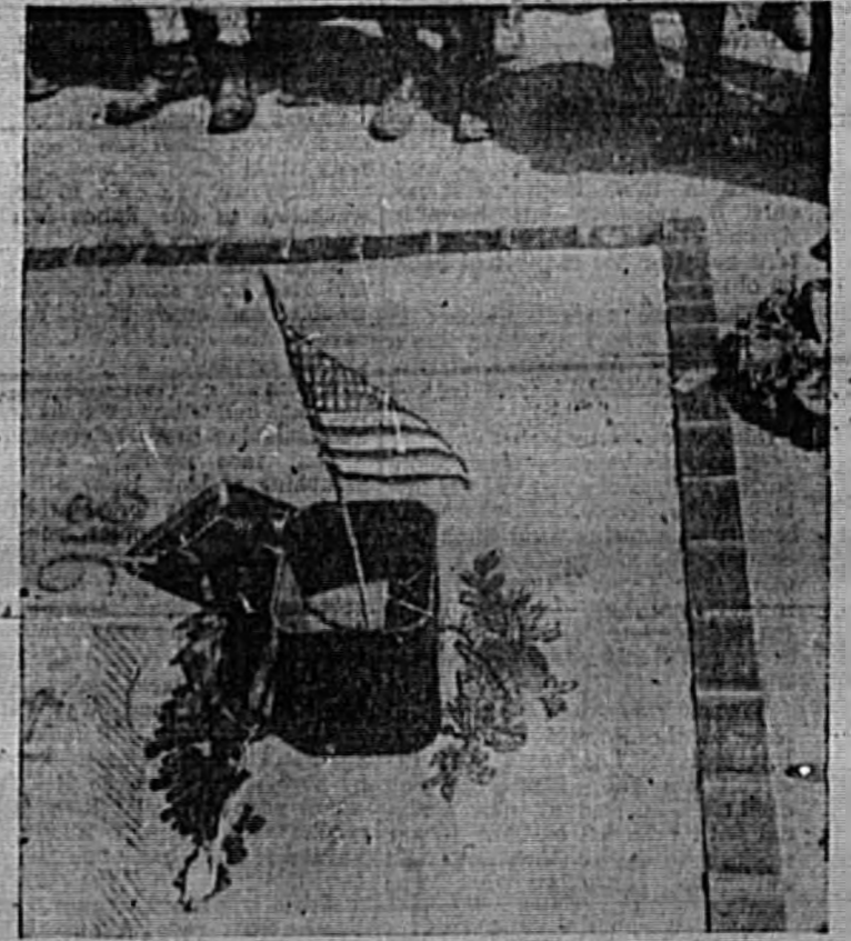
THIS PICTURE WAS MADE after a group of American Boy Scouts had placed a box filled with earth in the Parisian cemetery of France's Unknown Soldier. The soil was taken from Bedford's Island, New York, on which stands the Statue of Liberty. The Americans are attending the sixth world's Boy Scout Jamboree in Molsion, France.