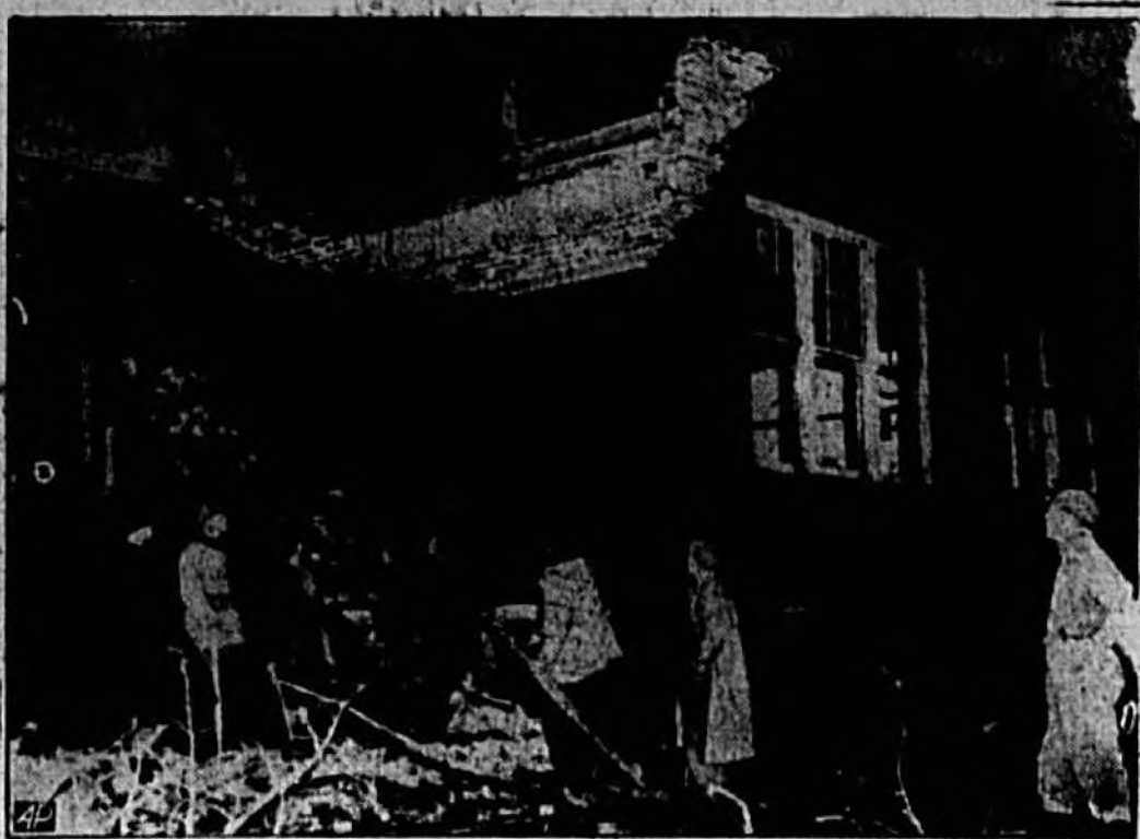
This scene of ruin was left at Belleville, Ill., by a terrifying tornado which struck a section of that town, killing at least eight persons. Many were injured and property loss was heavy.