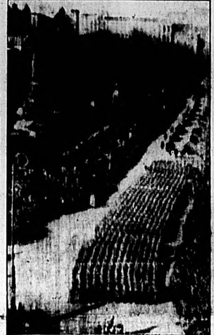
United German and Austrian troops are shown in this radio-photo as they paraded in Vienna at the climax of Adolf Hitler's spectacular but bloodless annexation of Austria. While thousands lined the streets to watch, infantry, armored cars, tanks, and artillery units marched along the Ringstrasse, the great circular boulevard in the heart of the city.