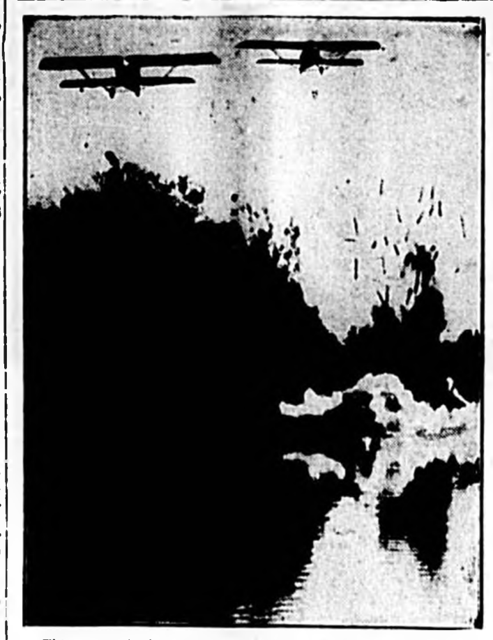
This unusual photograph was made just as two loyalist planes dropped their "eggs" on a bridge built by rebels over the river Guadalquivir near Seville, Spain. Pieces of the bridge may be seen flying into the air as the bombs hit their mark squarely.