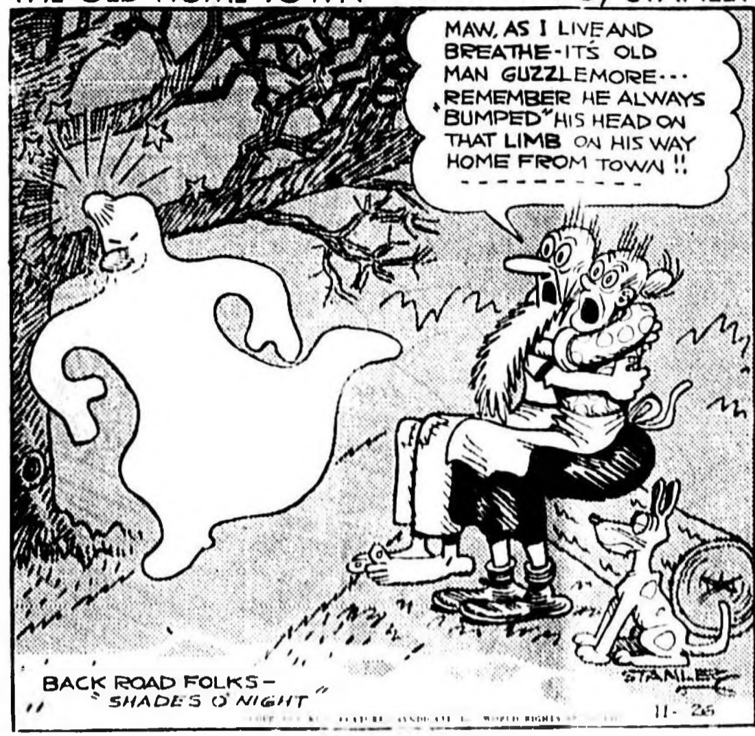
BACK ROAD FOLKS—SHADES O' NIGHT