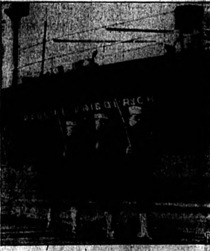
Coast Guardmen keep a careful watch on the German freighter Pennine Friederich in Boston harbor to prevent sabotage. Five ships were grabbed in the harbor in the nation-wide seizure of axis vessels.