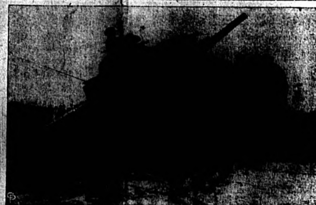
Tested at Aberdeen, Md., is the Army's new 25-ton tank, said to be the most powerfully armed machine of its type in existence...