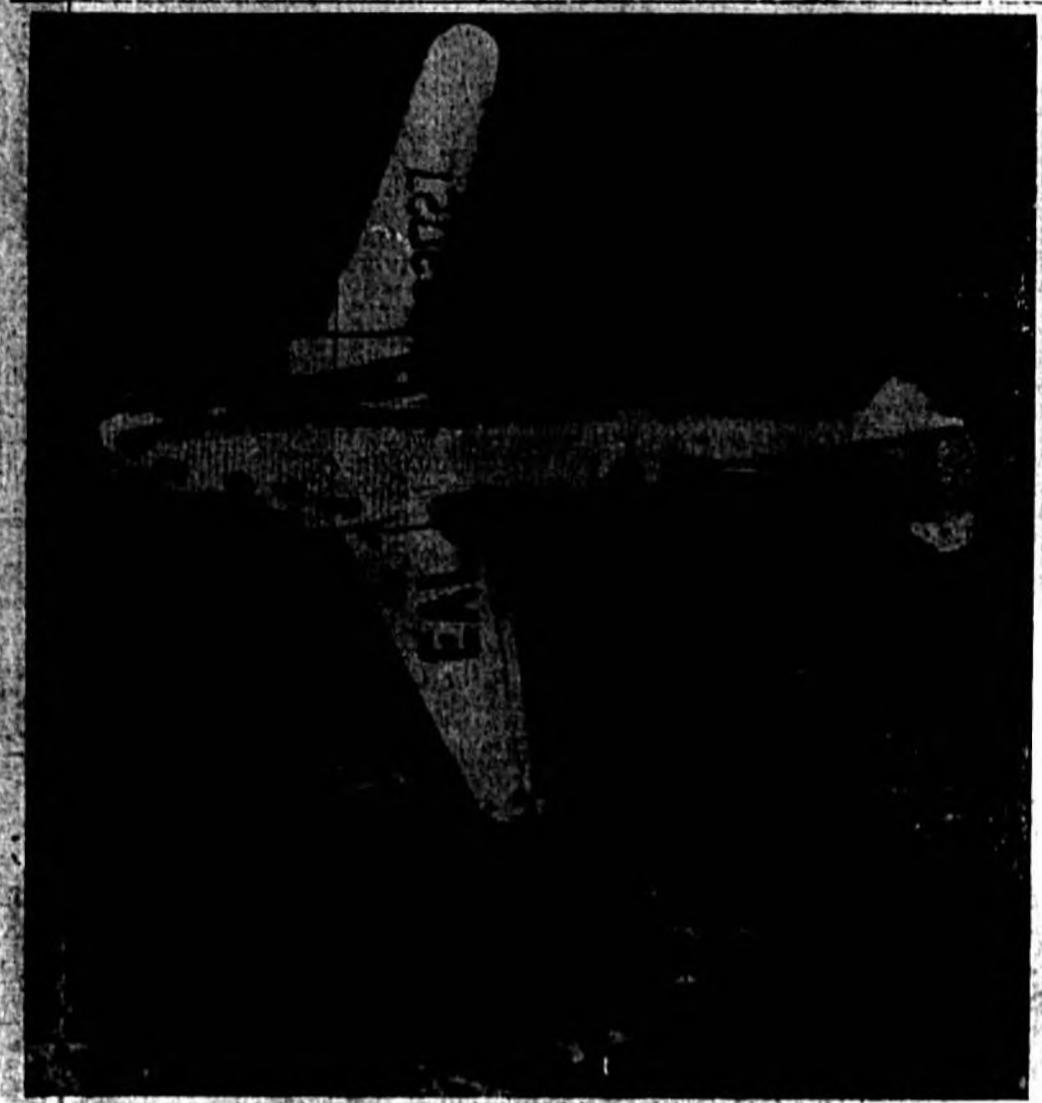
The Eastern Airlines plane lost for hours with thirteen persons aboard is shown in the swamp, 10 miles from Vero Beach, where the pilot brought it down. None of the plane's occupants was critically injured. Arrow shows one of the wheels from the damaged undercarriage. The plane was enroute from Miami to New York when it flew into a storm.