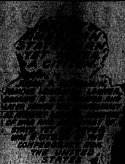
Portrait of a man, likely a historical figure related to the article.