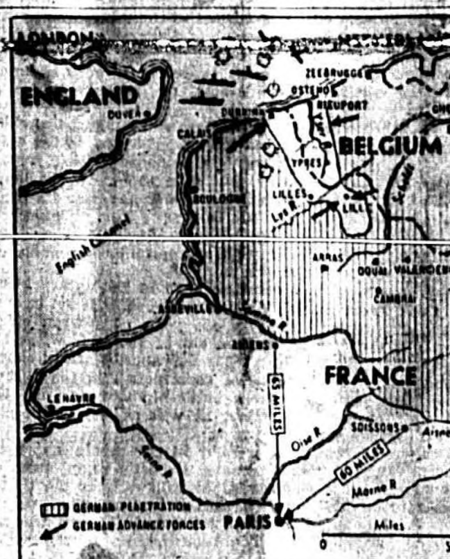
This map shows the principal theater of action in war-torn Europe, where Allied troops pocketed in Flanders were reported escaping to England amid fierce fighting. Big guns of the Allied fleet were brought into play to drop a protective barrage of fire and steel around the French "escape port" of Dunkirk.

Guns Of Fleet Cover Allied Retreat. Loss Of Dreadnaught Would Be Biggest To British Navy Since War Began.