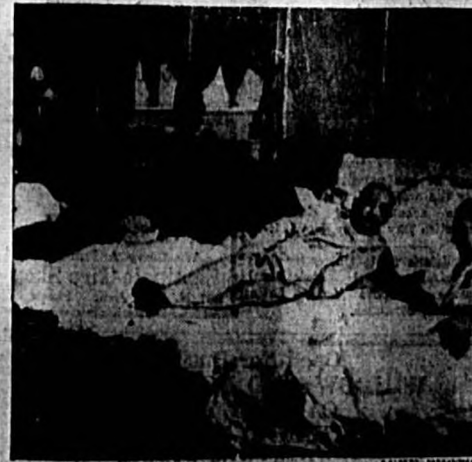
PASSENGERS ON the German liner Deutschland , which tonight five 200 miles off Cape Race, Newfoundland, were forced to leave the third-class stateroom and stand the night on improvised beds in the hull's hatched deck berths. Capt. Karl Steincke brought the ship to port without incident.