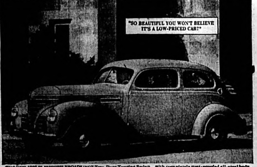
THE NEW 1939 PLYMOUTH "ROADKING" Two-Door Touring Sedan... with completely rust-proofed all-steel body.

YOU'LL BE SURPRISED at All the Extra Room, Comfort and Luxury in this Big, New 1939 Plymouth