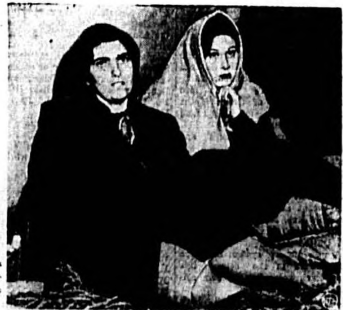
Eyes dull with despair, this Sudeten Jewish mother and daughter huddle on the cold ground of a refugee camp in the no-man's-land between German Sudetenland and Czechoslovakia. Like hundreds of other Jews, they were forced from their Sudetenland home after Germany took the area, and refused entry into Czechoslovakia. They live by the roadside, penniless and hungry, scrounging in the fields for potatoes overlooked by harvesters. Their only shelter is a tarpaulin given by a sympathetic frontier guard.