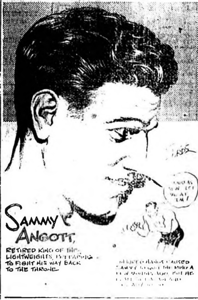
SAMMY ANGOTT, RETIRED KING OF THE LIGHTSIGHTS, IS PLANNING TO FIGHT HIS WAY BACK TO THE THRONE.