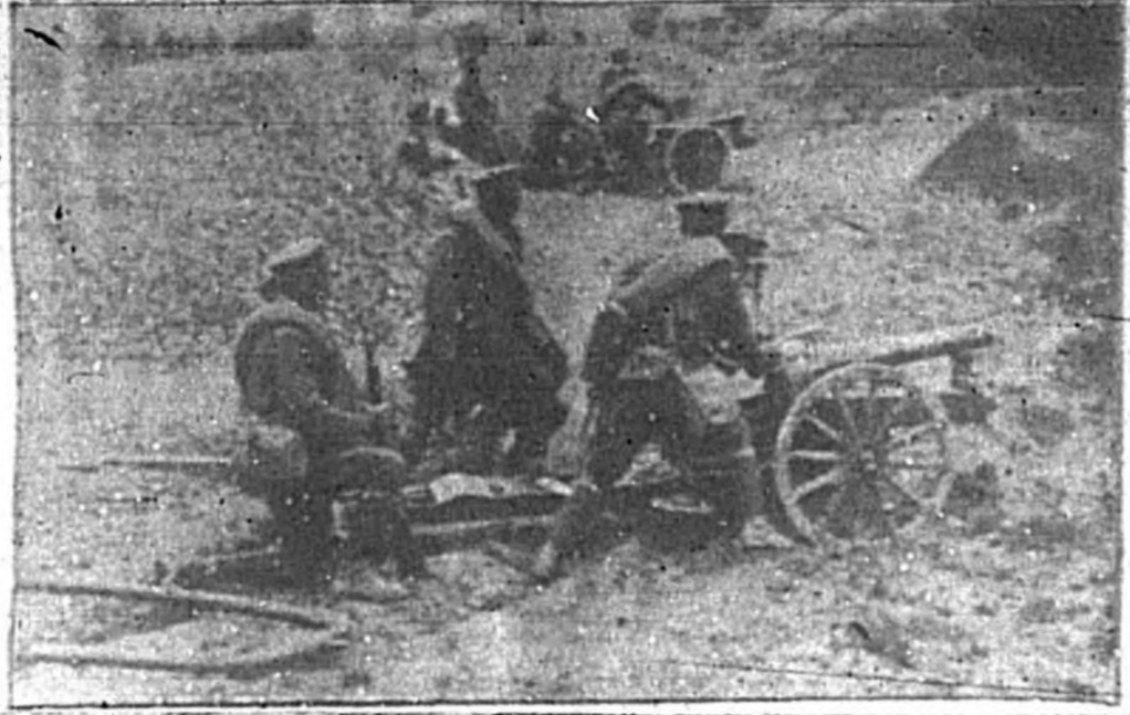
Strained relations between Japan and Russia threatened to reach the breaking point when Soviet infantry troops crossed from Siberia into Manchuria, Japanese-sponsored Manchuria, and were surrounded by Manchukuo soldiers. Thus trapped, the invaders begged that they be allowed to retire and the position was taken under consideration by the Manchukuo government. This picture shows a typical detachment of Manchukuo infantrymen manuevering with modern field pieces supplied by Japan.