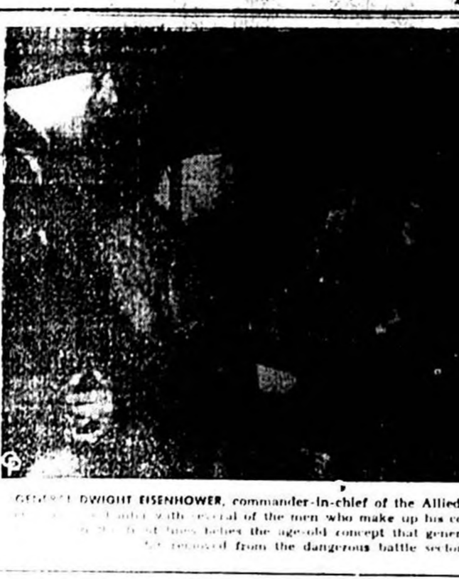
General Dwight Eisenhower, commander-in-chief of the Allied forces in North Africa, stops to see...