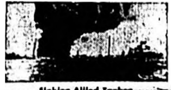
Making Allied Bombs

VOLUME XXXIV. Established in 1908. SANFORD, FLORIDA, MONDAY, APRIL 5, 1943. Member Associated Press. NUMBER 157.