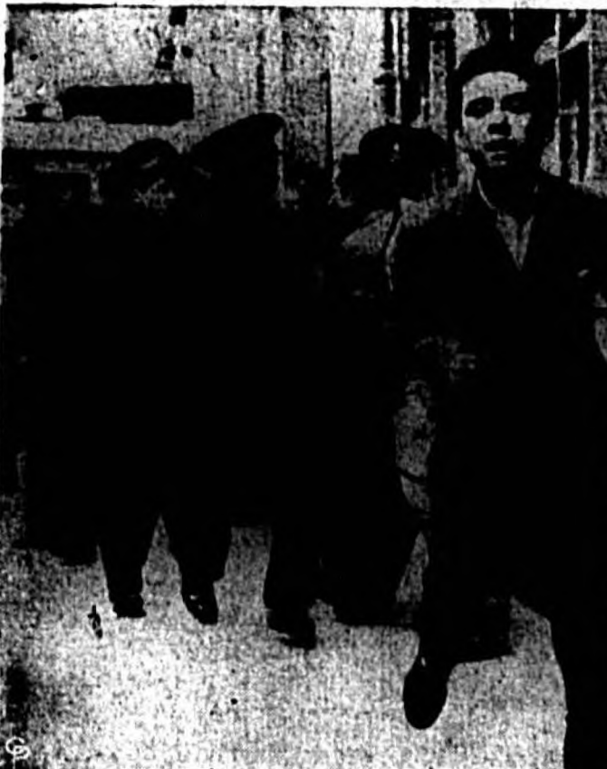
Police are shown here with some of the 15 students of the University of Mexico arrested after a riotous demonstration outside the office of Mexican Foreign Minister Padilla, in Mexico City. One of those arrested was identified as a Nazi agent.