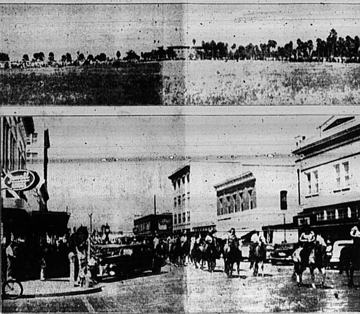
More than 85 cow ponies and saddle horses and their riders participated in the parade of the Dusty Boots and Saddle Club through downtown Sanford last Monday morning in preparation for the horse races and tournament held that afternoon. The top photograph shows the east end of Fort Mellon Park with thousands of people lined up on both sides and the Mayfair Inn in the background as the horse races were getting under way.