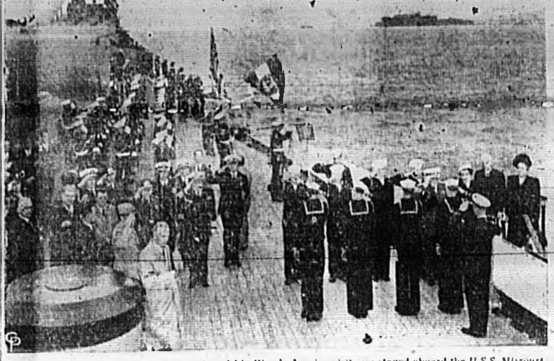
ONE OF THE MOST IMPRESSIVE ceremonies of his Rio de Janeiro visit was staged aboard the U.S.S. Missouri as President Truman (left) bade goodbye to visiting diplomats. In foreground, wearing military uniform, is Brazilian President Getulio Vargas. Just behind Marshall, in military uniform, is Brazilian President Getulio Vargas. In background, at attention, is a detachment of U. S. Marines and, in right foreground, saluting sailors from a guard of honor.