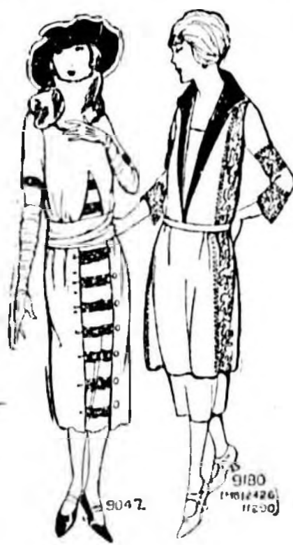
CLEVER NEW BRAID TRIMMINGS

One finds definite pleasure in the employment of the new braids, especially on frocks for semi-formal wear. In sponge color pique, the dress to the left strikes a new note in simplicity. The gathered skirt with extension on the front gore, is attached to a long-waisted blouse and trimmed with short bands of caramel brown silk braid. Single bands of the braid finish the short sleeves, while a girle of self-material holds in the fullness at the waist. Medium size requires 3 yards 34-inch material, with 2 yards inch-wide braid. Narrow silk soutache, also in brown, is stitched upon a background of tulle color tricotine, for the decoration of the second model. The trimming is repeated on the short sleeves with beautiful effect, but the deep collar is of brown silk duvetyne. Medium size requires 3 1/2 yards 34-inch material and two bunches of soutache braid. First Model: Pictorial Review Dress No. 9047. Sizes, 34 to 44 inches bust. Price, 35 cents. Second Model: Dress No. 9180. Sizes, 34 to 44 inches bust. Price, 35 cents. Braiding No. 12426. Transfer, blue or yellow, 25 cents, and 11290, transfer, blue or yellow, 20 cents.