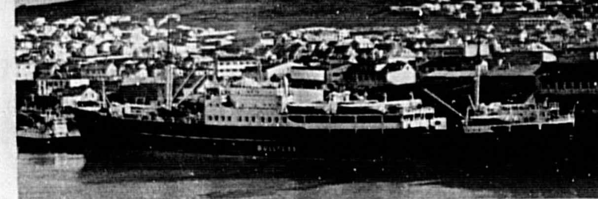
HAYMAEY ISLAND with the volcano in the background as it appeared on more peaceful days, serving as a dockage for ships and fishing boats utilizing the southeast coast of Iceland.