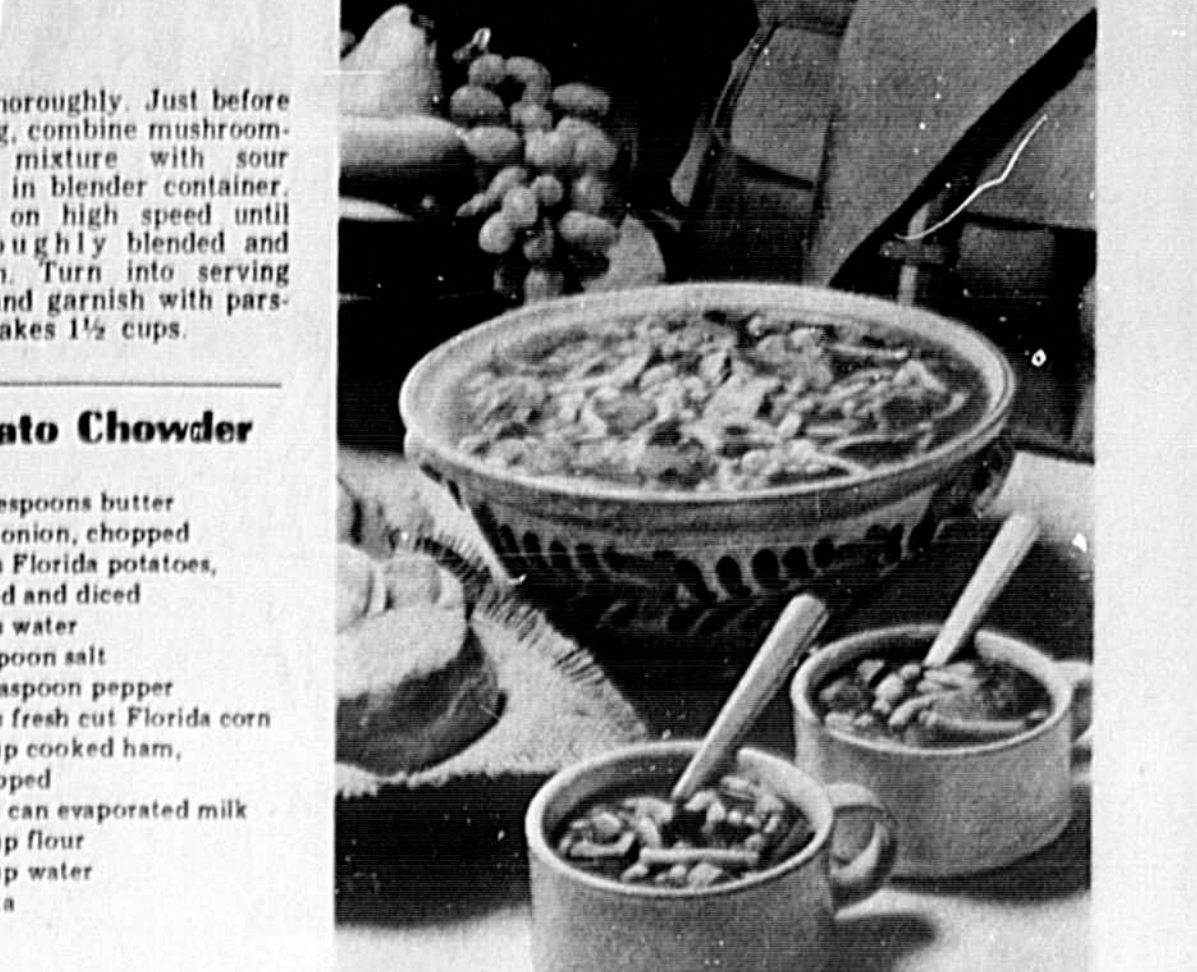
Turkey, corn and bean chowder make hearty chowder for teen-agers.