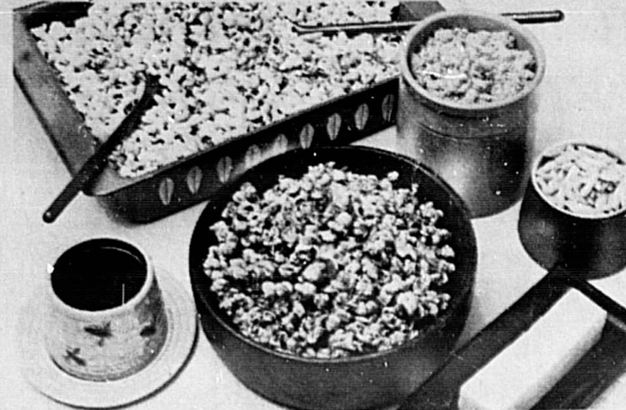
HONEY CRACKLE - It's a wonderful popcorn and almond confection.