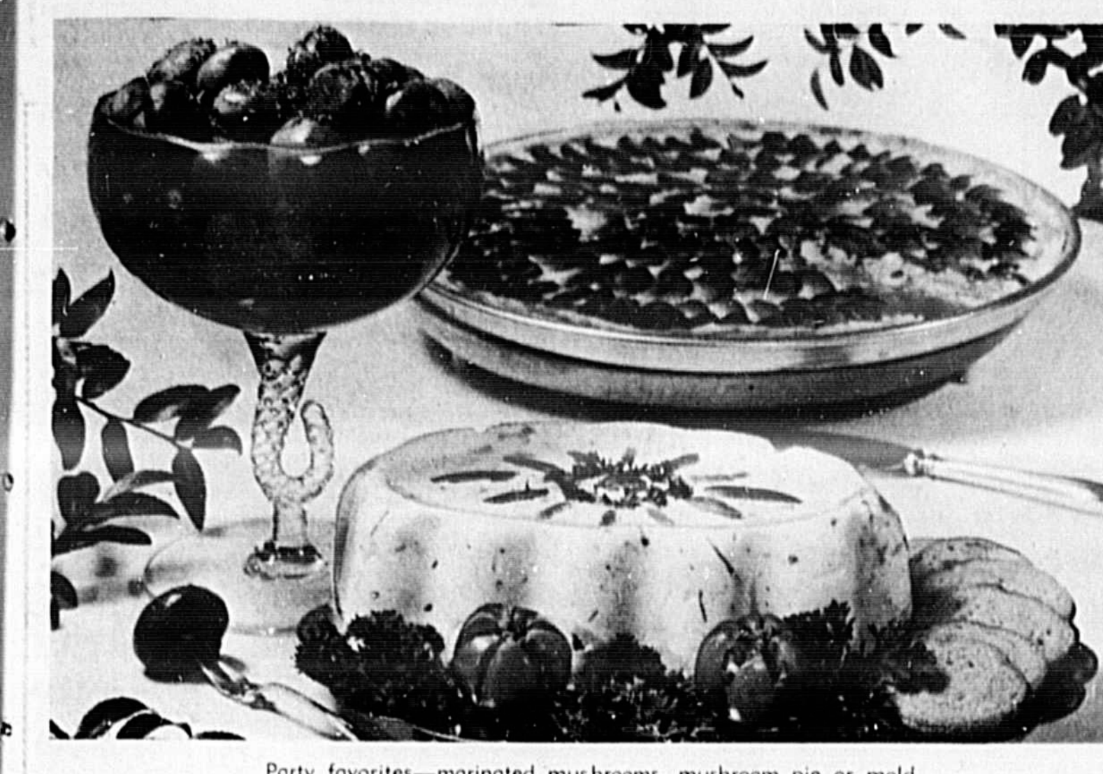
Party favorites—marinated mushrooms, mushroom pie or mold.

By AILEEN CLAIRE NEA Food Editor Those who entertain often or very little face the same dilemma: What to serve as appetizers that are different and hopefully low in calories?