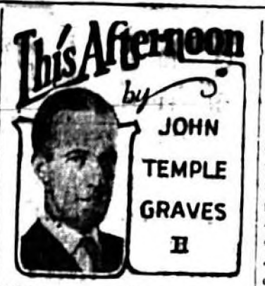
Nothing is certain but death and taxes.