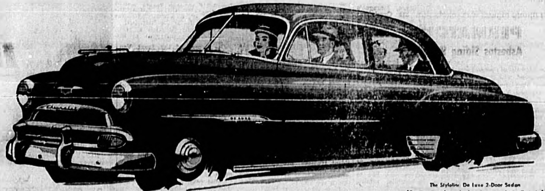
The Stylized DeLuxe 2-Door Sedan (Continuation of standard equipment and trim illustrated is dependent on availability of material.)

America's Largest and Finest Low-Priced Car!