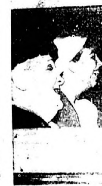
Mrs. Franklin D. Roosevelt

pleasured with her mother-in-law, Mrs. Sara Delano Roosevelt, mother of the President, as they left Boston Mass., by automobile for the Roosevelt summer home at Campobello Island in New Brunswick, Canada.