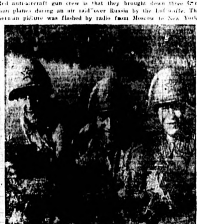
Red infantrymen, camouflaged in the brush, await contact with Nazi troops, according to the caption which accompanied this radiophoto, the first ever to be transmitted from Moscow to New York. It was sent through RCA experimental facilities.