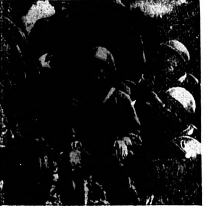
According to the caption supplied by the Soviet censor with this picture, the reason for the board smiles on the faces of this Red anti-aircraft gun crew is that they brought down three German planes during an air raid over Russia by the Luftwaffe. The German picture was flashed by radio from Moscow to New York.

pleasured with her mother-in-law, Mrs. Sara Delano Roosevelt, mother of the President, as they left Boston Mass., by automobile for the Roosevelt summer home at Campobello Island in New Brunswick, Canada.