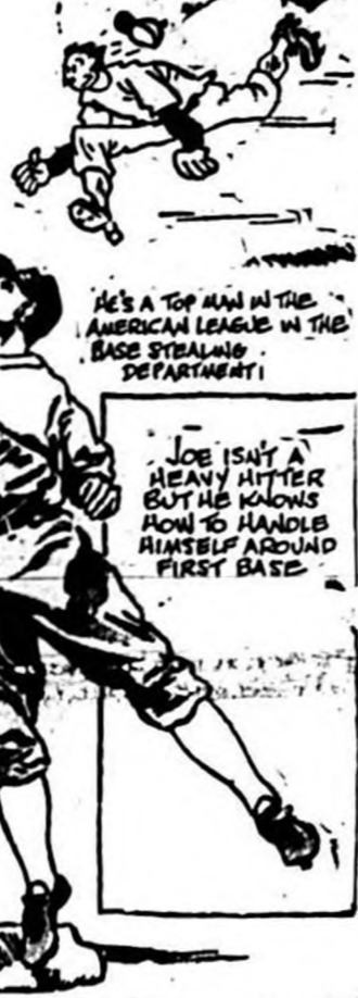
HE'S A TOP MAN IN THE AMERICAN LEAGUE IN THE BASE STEALING DEPARTMENT! JOE ISN'T A HEAVY HITTER BUT HE KNOWS HOW TO HANDLE HIMSELF AROUND FIRST BASE.