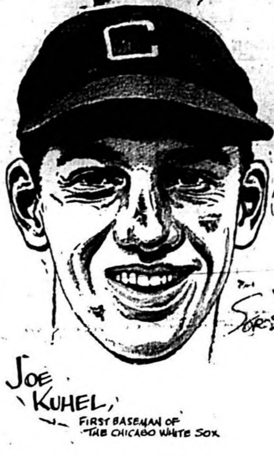
JOE KUHEL, FIRST BASEMAN OF THE CHICAGO WHITE SOX.