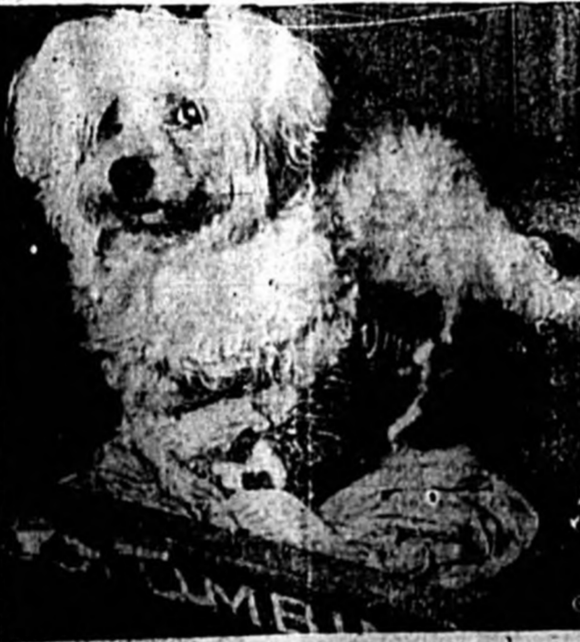
A year ago Tiny the poodle was smitten with the tragedy of a stillborn pup and was compensated by being allowed to nurse a kitten, which a few days ago herself became mother of three. Now, with her foster daughter's consent, Grandma Tiny is nursing two of the litter at her home in New York.