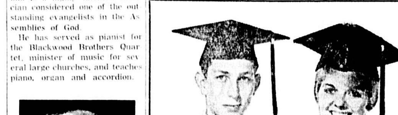
BEST WISHES CLASS OF 1967 Congratulations to the graduates of Seminole County. Now is the time to plan for a sound financial future. Consider our many banking services and establish your credit in our area.