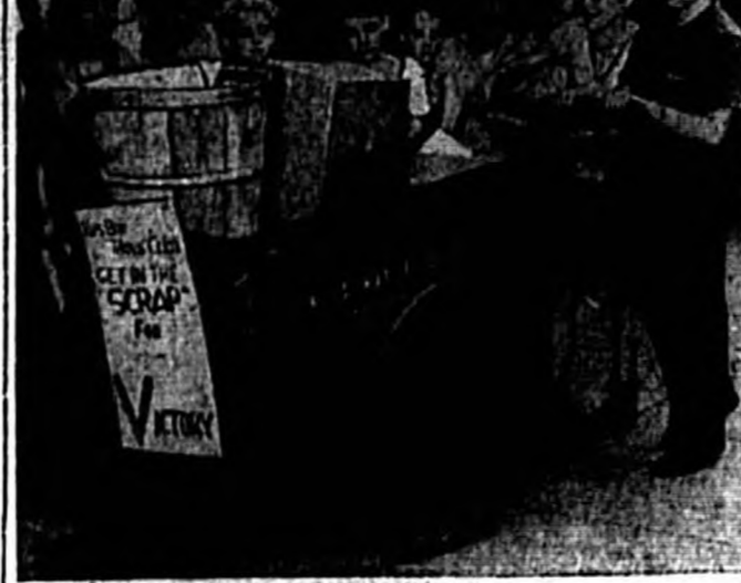
Members of the Boys' Clubs of America, which number about 500,000 youngsters, are forming salvage corps all over the country that will cover set routes on a weekly schedule to pick up all kinds of scrap and then aid in the war effort. The salvage corps at the Kips Bay Boys' Club, in New York City, is shown bringing in the first load of scrap as the nationwide drive gets under way.