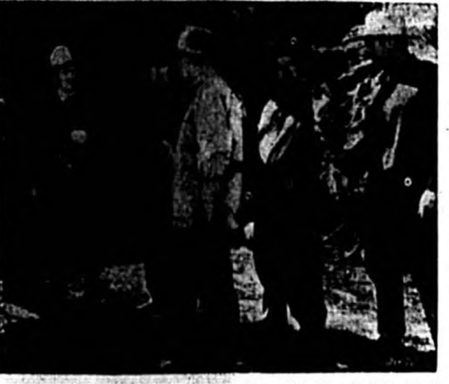
Gene Autry, America's No. 1 Cowboy, with his sidekick, Smiley Burnette, in their newest Republic release, 'Stardust on the Sage'.

According to law, Egypt's king must be a Moslem, one of Moslem parents, and a Moslem descendant of Moslems. The chief in Chinese musical instruments with 11 strings, played by plucking is the guqin.