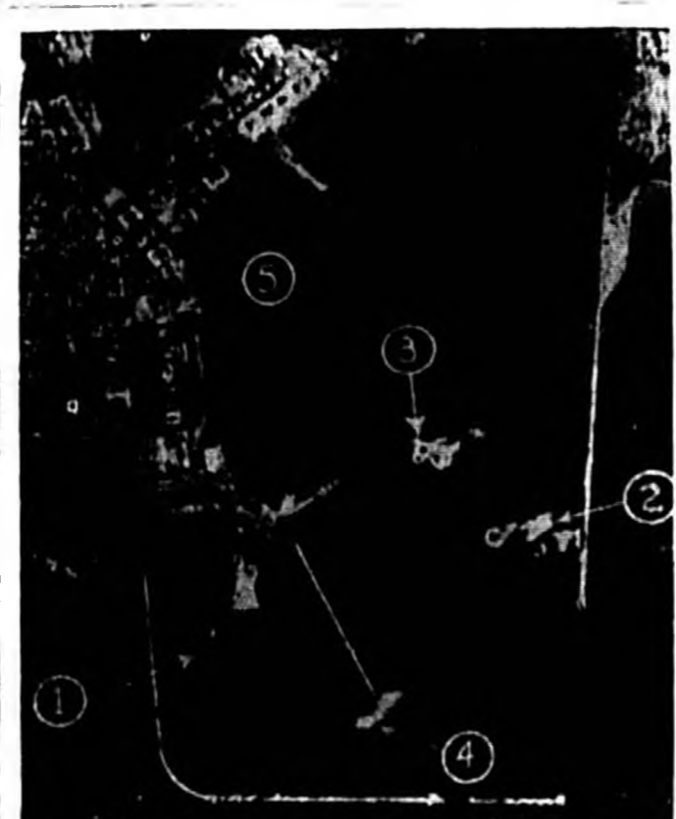
This is an aerial view of the city of Bengazi in Libya after an RAF raid on Oct. 7. The city has been hit by incendiary bombs and the harbor is filled with smoke.