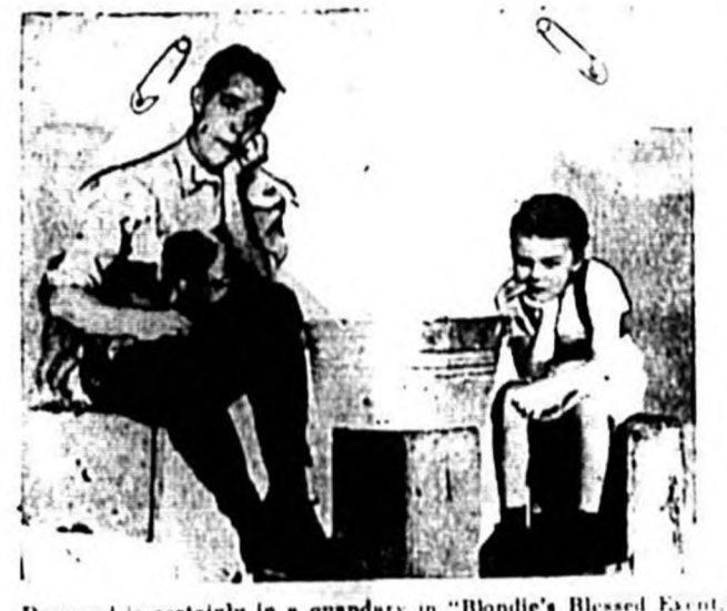
Dagwood is certainly in a quandary in "Blonds Blasted".