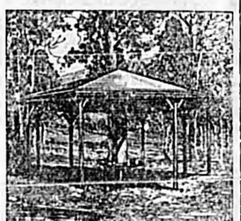
Picnickers Have Little Fear of Passing Rainstorms When a Substantial Shelter is Near to Protect Clothing and Food.

A dead tree, the trunk of which is still quite sound, makes an excellent start for such a shelter. It should be cut off about ten feet from the ground, care being taken to make the saw cuts as even as possible.