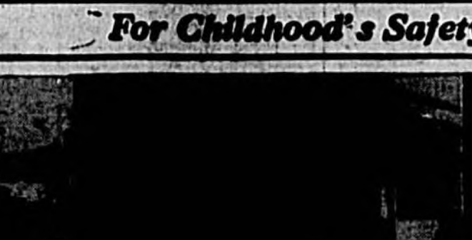
The best seats of some apartment houses in ...