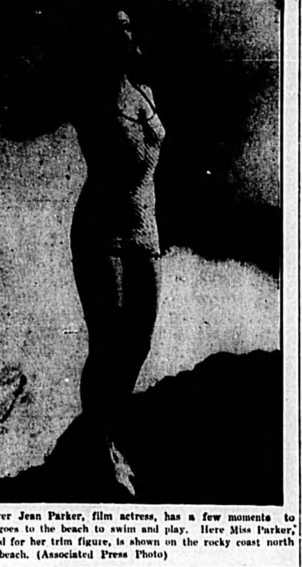
Whenever Jean Parker, film actress, has a few moments to spare, she goes to the beach to swim and play. Here Miss Parker is noted for her trim figure, is shown on the rocky coast north of Malibu beach.

AT THE CHURCHES... CHRISTIAN CHURCH OF GOD... WEDNESDAY, AUGUST 22, 1936. 10:00 A. M. Morning Service. 7:30 P. M. Evening Service.