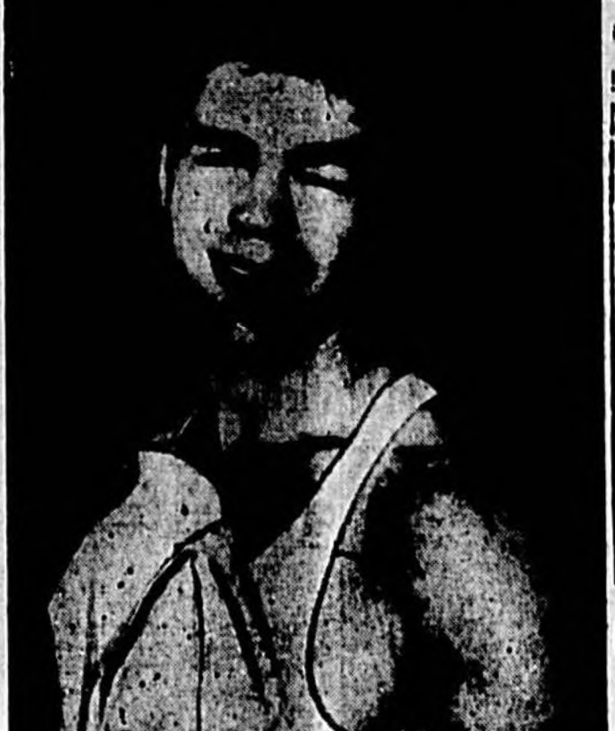
Max Schmeling, ex-champion and recent victor over Joe Louis, Detroit Brown Bomber, who yesterday signed up for a fight with Champion James J. Braddock next June.