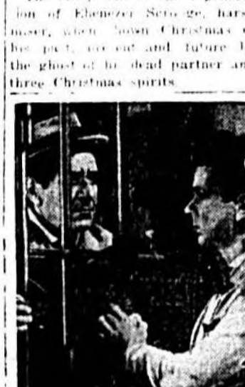
JACKIE COOPER and Robert Warwick in "Gangster's Boy" opening Thursday at the Ritz.