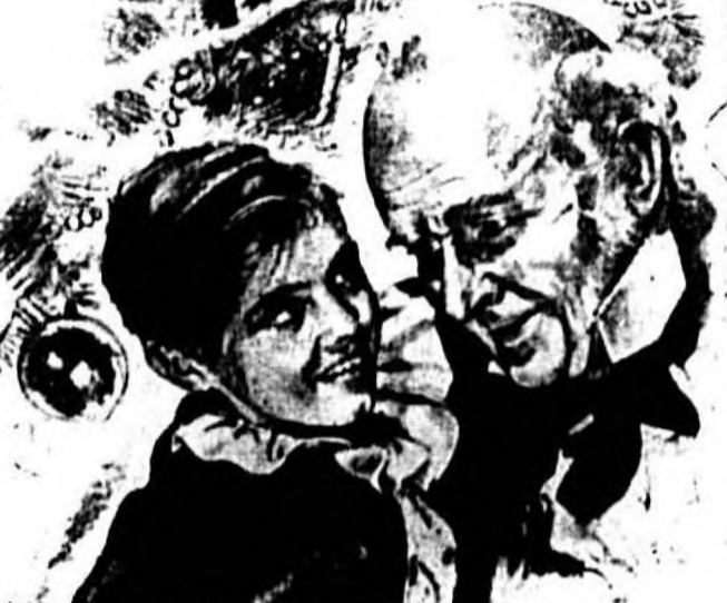
"A CHRISTMAS CAROL," Charles Dickens' beloved story of the regeneration of an old miser through the heart of a tiny, crippled boy, has brought Yuletide cheer to millions of readers throughout the world.