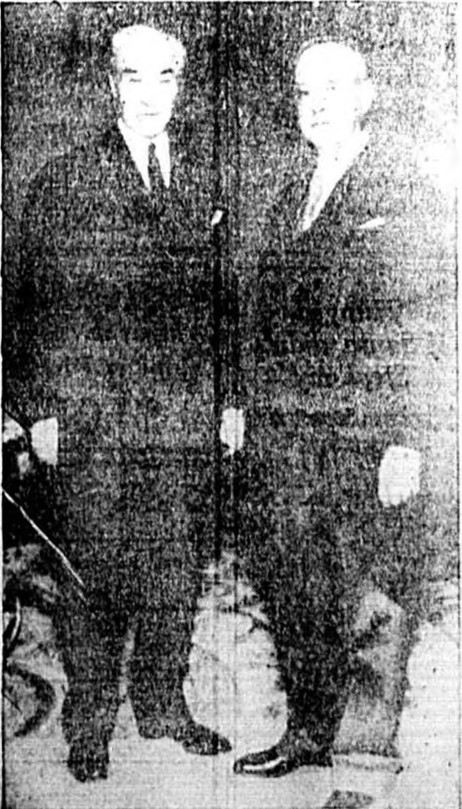
Secretary Hull and Alf Landon at the Pan-American Confer... ence. Mr. Landon, leaved the Lambeth Walk at a Lima night... club—but surely not in these pants.