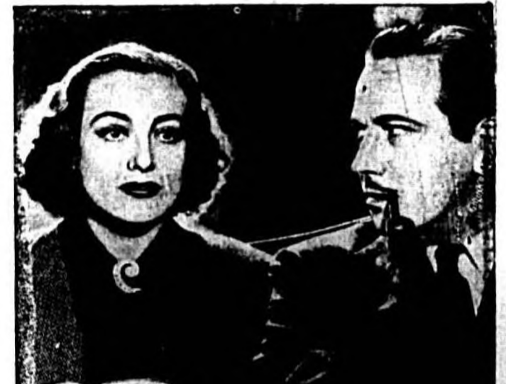
JOAN CRAWFORD and Melvyn Douglas in "The Shining Hour" opening Sunday at the Ritz.