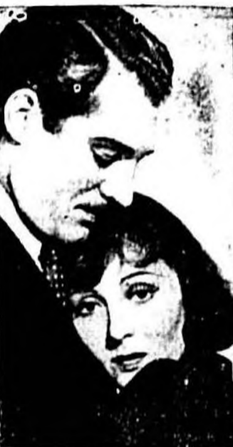
ALAN MARSHAL and Luise Rainer in "Dramatic School" opening Tuesday at the Ritz.