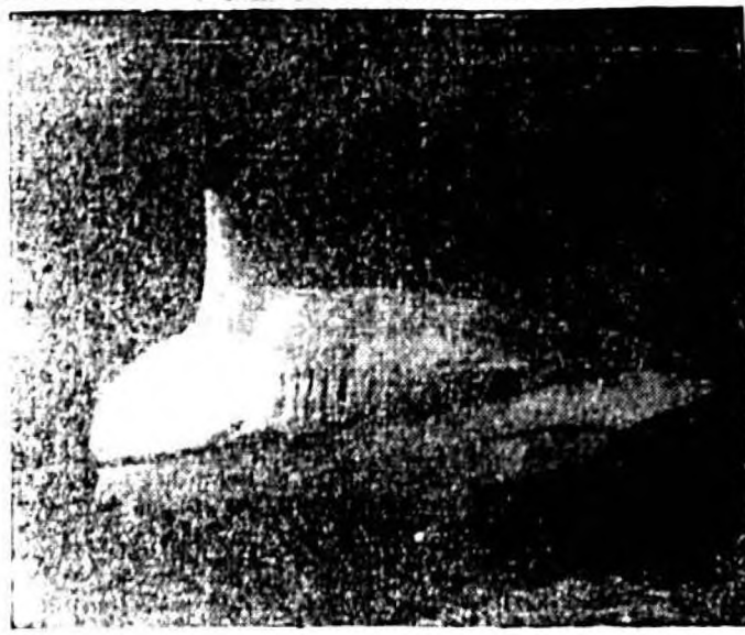
MADE IN... Eleven feet of snowy, living... at the photographer, as this huge ground... observation, pathologic at Marine Studios...