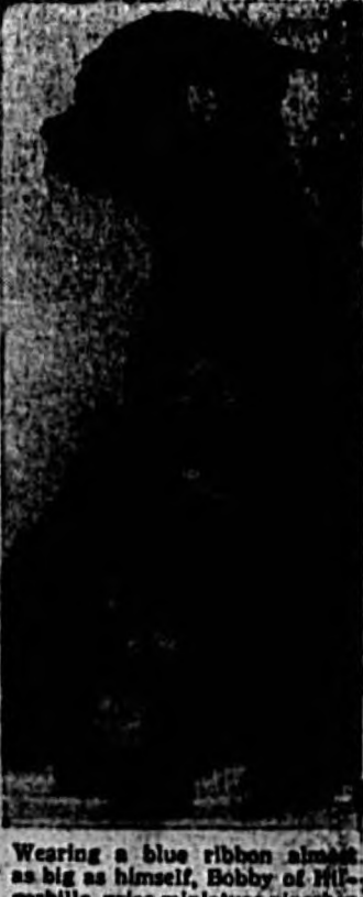
Wearing a blue ribbon almost... as big as himself, Bobby of Mi... ssissippis, prize miniature pin... ner of the 44th annual Philadel... phia Kennel Club Dog Show, pr... displays his trophy.