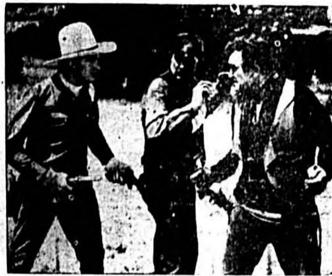
GENE AUTRY, Tom London and Bob Osborne in a scene from the Republic Picture, "Prairie Moon" opening Saturday at the Ritz.

The Port of New Orleans has a water frontage of 124 miles and each year handles export valued at approximately $300,000,000 and imports valued at $150,000,000.