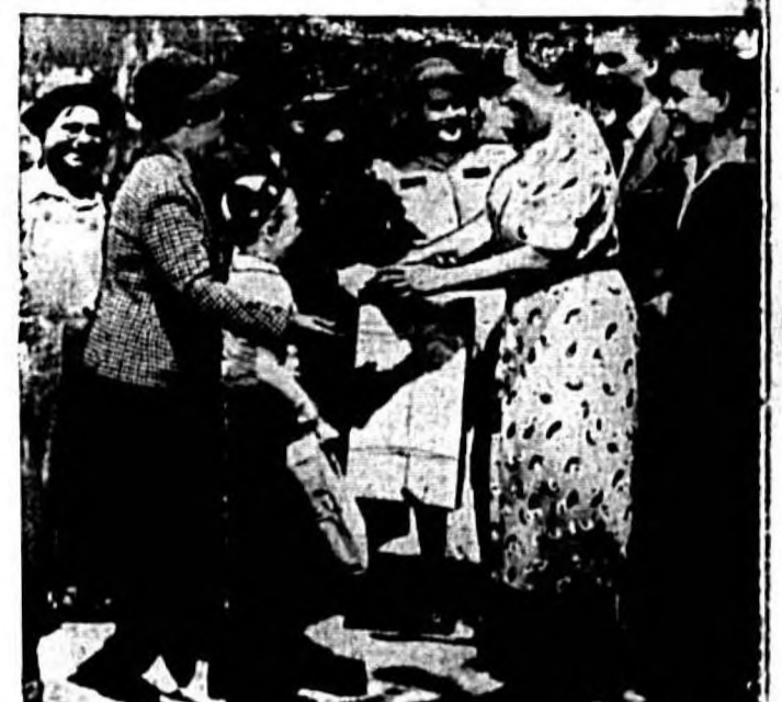
THE JONES FAMILY goes down to Aunt Ida's farm for some peace and quiet—and darned if there isn't more fun and excitement than there was back in Maryville! Above, left to right, are Eddie Collins, Spring Byington, Jed Prouty, Billy Mahan, June Carlson, Louise Fazenda, Ken Howell and George Ernest in 20th Century-Fox's "Down On The Farm," opening Saturday at the Princess Theatre.

Scrooge, Tiny Tim, the Cratchits and the rest of the beloved characters in the Charles Dickens' story come to life in "A Christmas Carol," filmization of the classic tale, which comes Thursday to the Ritz Theatre.