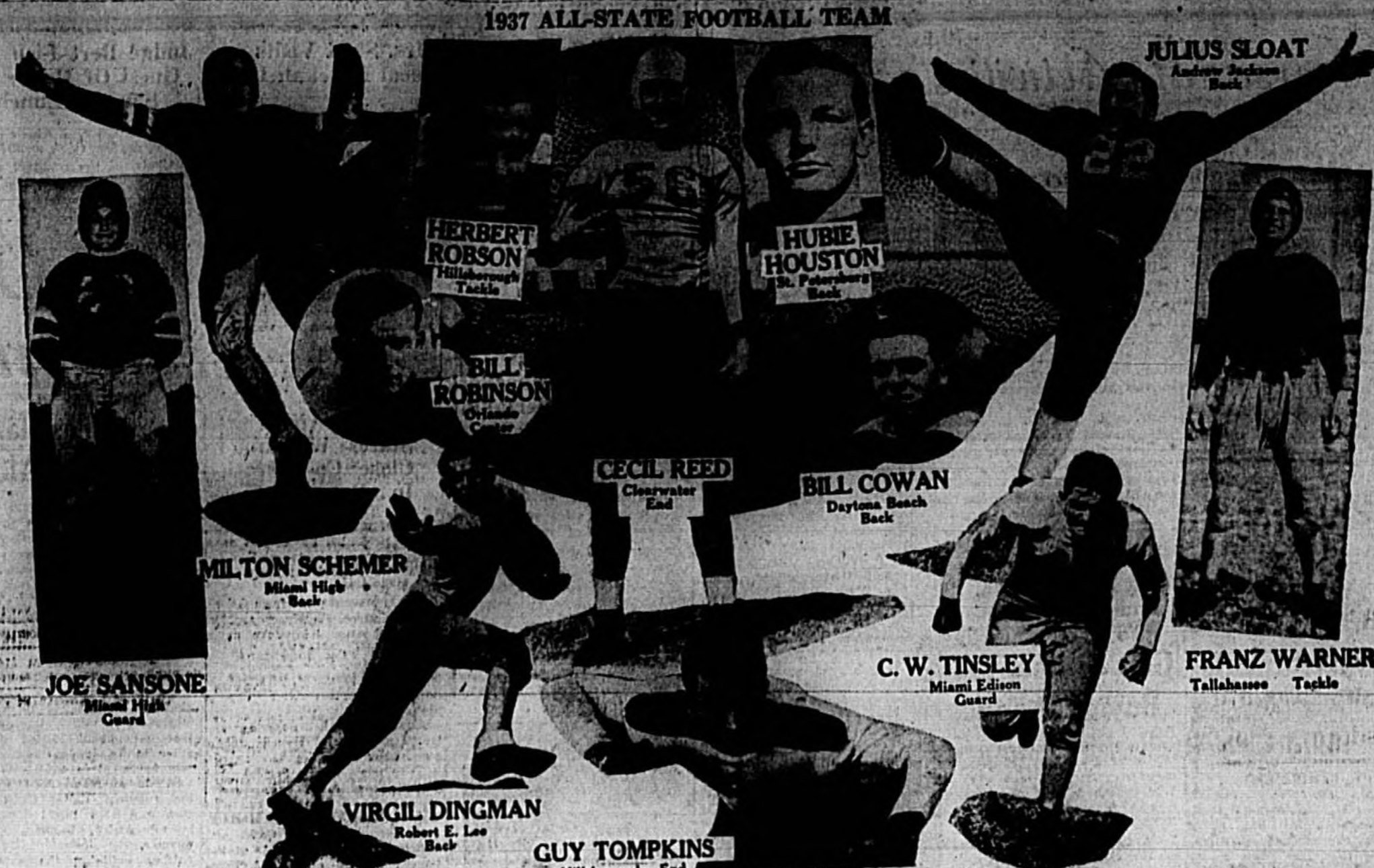
1937 ALL-STATE FOOTBALL TEAM