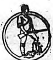
Minute Man Six

We have sold in the last Three Weeks, Three Lexington Cars and have several orders for future delivery.