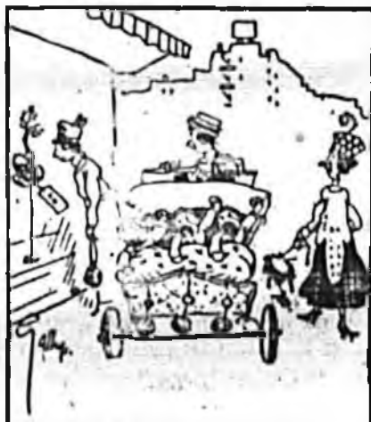
"Ever and Anon Lifting Melodious Voices in Song."

Baby cabs are built in several models, and can be made to accommodate twins or triplets with perfect ease. There is nothing more inspiring to all who love our country and delight to watch it grow than the sight of a