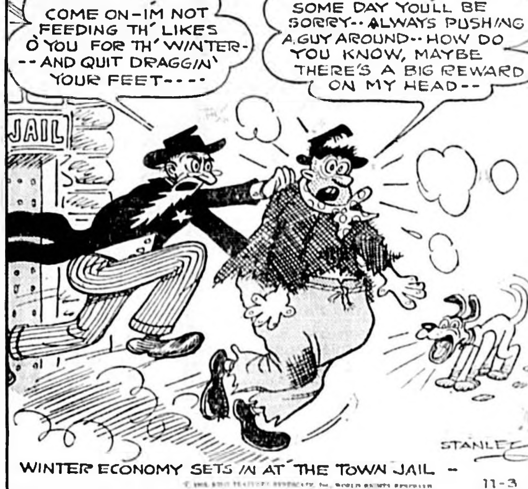
WINTER ECONOMY SETS IN AT THE TOWN JAIL — 11-3