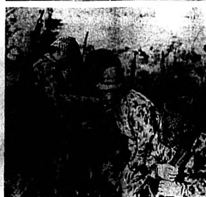
After a strenuous workout during maneuvers, these U. S. troops, wearing green camouflage suits and nets on their helmets, stop to light cigarettes. The men staged a camouflage demonstration for officers participating in the Second Army mobile Tennessee maneuvers.