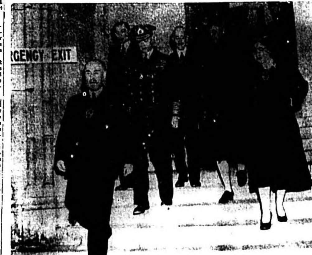
Accompanied by the Lord Chamberlain, the King, Queen and First Lady were seen in London today. The King and Queen were seen in London today. The King and Queen were seen in London today.

First Lady At Guildhall With King and Queen