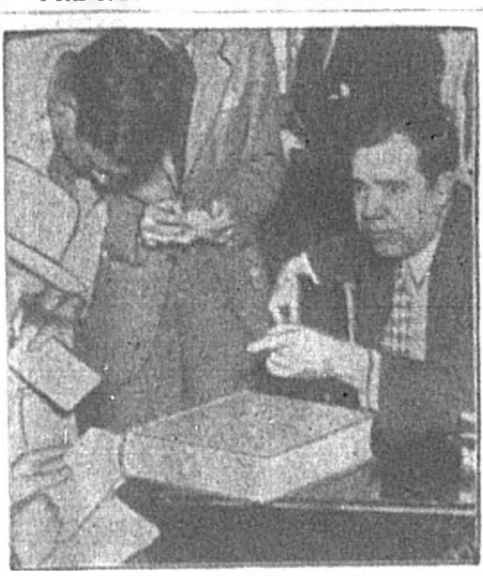
Senator Huey P. Long of Louisiana was caught by the camera in the west wing of the capitol building in 1934.

Hurricane Danger Vanishes As Storm Goes To Bermuda