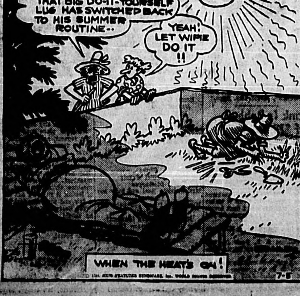
WHEN THE HEAT'S ON! © 1956 AMERICAN SYNDICATE, INC. WORLD WIDE DISTRIBUTION 7-5