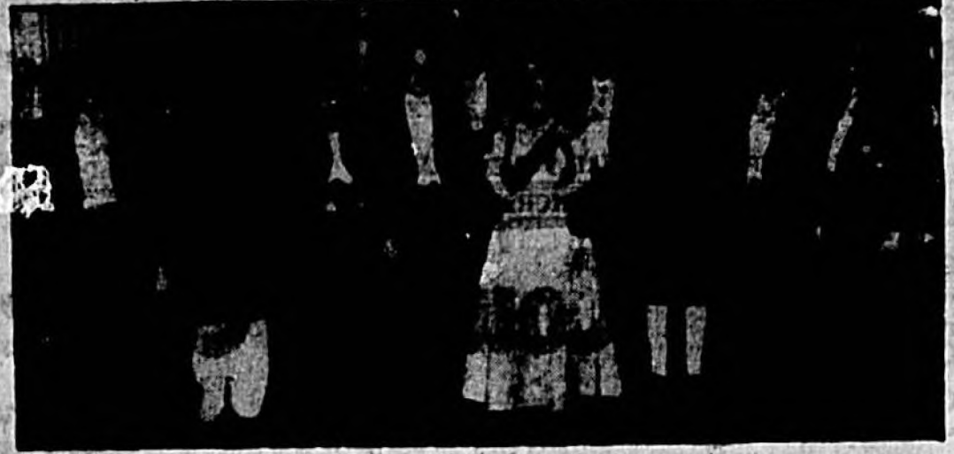
THE PRIME MINISTERS of the British Commonwealth met with Queen Elizabeth II at Buckingham Palace. They are in London, England, for a discussion on a variety of international problems. In the group (l. to r.) are: Johannes Strijdom, Prime Minister of South Africa; Mohammed Ali, Pakistan; Sidney Holland, New Zealand; Louis St. Laurent, Canada; Sir Anthony Eden, England; Queen Elizabeth; Robert Menzies, Australia; Pandit Nehru, India; Solomon Bandaranaike, Ceylon; and Lord Malvern, Central African Federation of Rhodesia and Nyasaland.