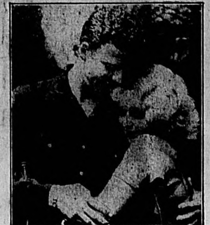
Here's Clara Bow, turbulent screen star, pictured with Rex Bell, the "boy friend," just before leaving Hollywood for a vacation at Bell's large ranch near the Nevada border. The screen star recently suffered a nervous breakdown which necessitated her retirement from the screen for a short time.