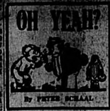
By PETER SCHAAL

Second Game: Boston 000 000 000-0 5 2. St. Louis 000 001 000-1 6 0.