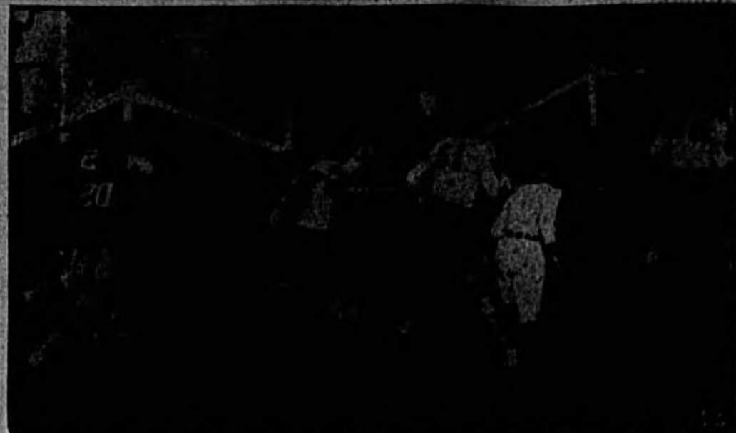
Flushed with their 16 to 0 victory over night 7 Vanderbilt, the week before, the Yellowjacks of Georgia Tech found it necessary to extend these lives to beat Clemson College 7 to 0 in Atlanta. Here's one of the tough breaks that beset the Tech men. Murphy (22), Tech fullback, is fumbling a pass tossed by Fletcher Sims, Yellowjacket quarterback.