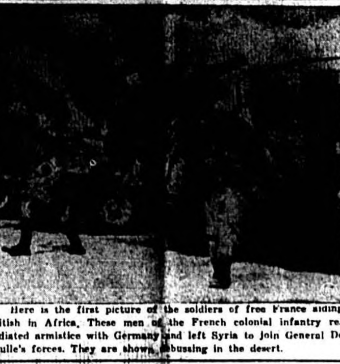
Here is the first picture of the soldiers of free France aiding British in Africa. These men of the French colonial infantry repudiated armistice with Germany and left Syria to join General De Gaulle's forces. They are shown, marching in the desert.