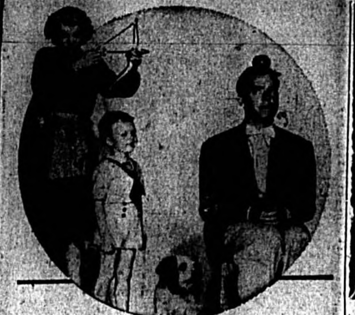
'BLONDIE PLAYS CUPID' is the latest in the popular series featuring Blondie, Dagwood, Baby Dumpling and Daisy and will be screened next Tuesday as part of a popular double feature...