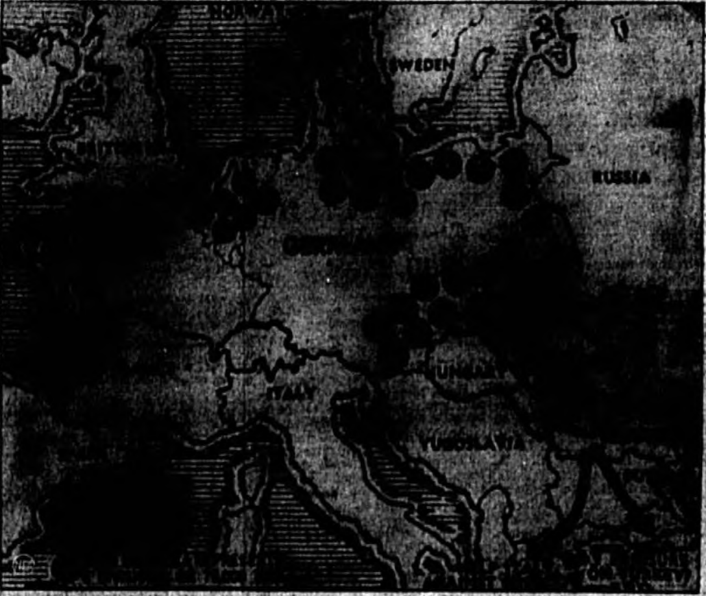
This map shows German troop concentrations, positions and the question of admission to Romania.