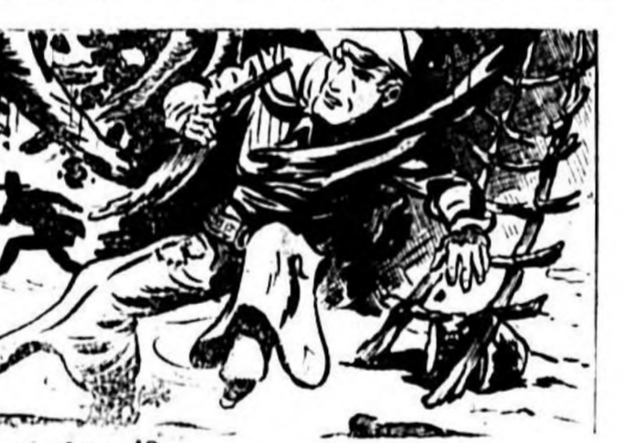
DAN DUNN—Secret Operative 48