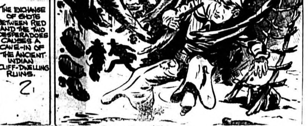
DAN DUNN—Secret Operative 48