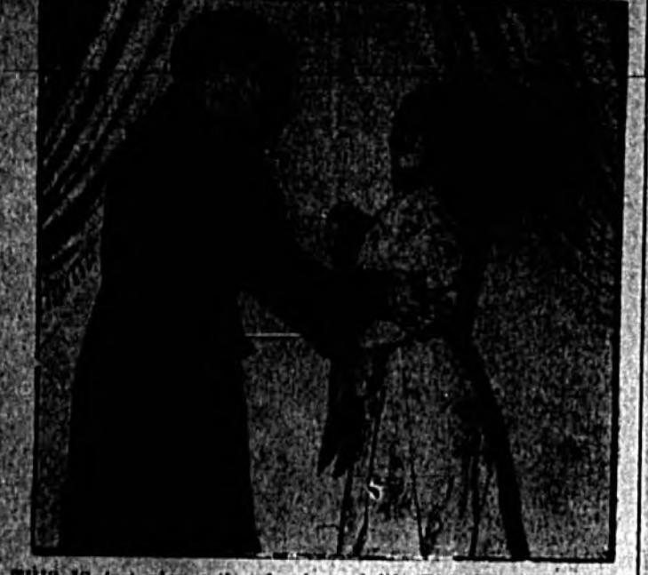
THIS IS just play acting for in real life Dick Powell and Joan Blondell are Mr. and Mrs. but in their latest picture, 'I Want a Divorce'...