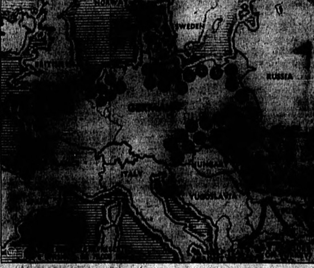
This map shows German troop concentration, positions and the question of extension in.