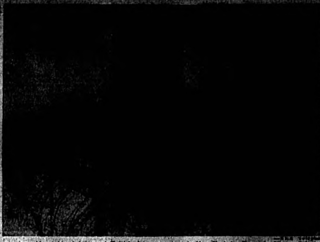
As cables told of increased British fears of a German invasion attempt this photo arrived in New York by German Clipper "along south coast." Passed by censor.

The scale is a pest that attacks citrus trees. It is a small, flat, oval insect that attaches itself to the bark of the tree. It feeds on the sap of the tree and causes the tree to become stunted and eventually die.