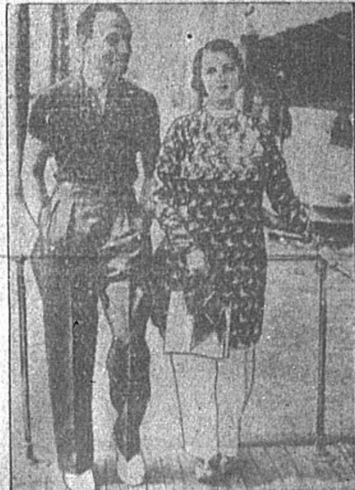
Here is an informal picture of Count and Countess Kurt von Haugwitz-Reventlow of Denmark, taken while they were vacationing in Venice. The countess is the former Barbara Hutton, Woolworth heiress.