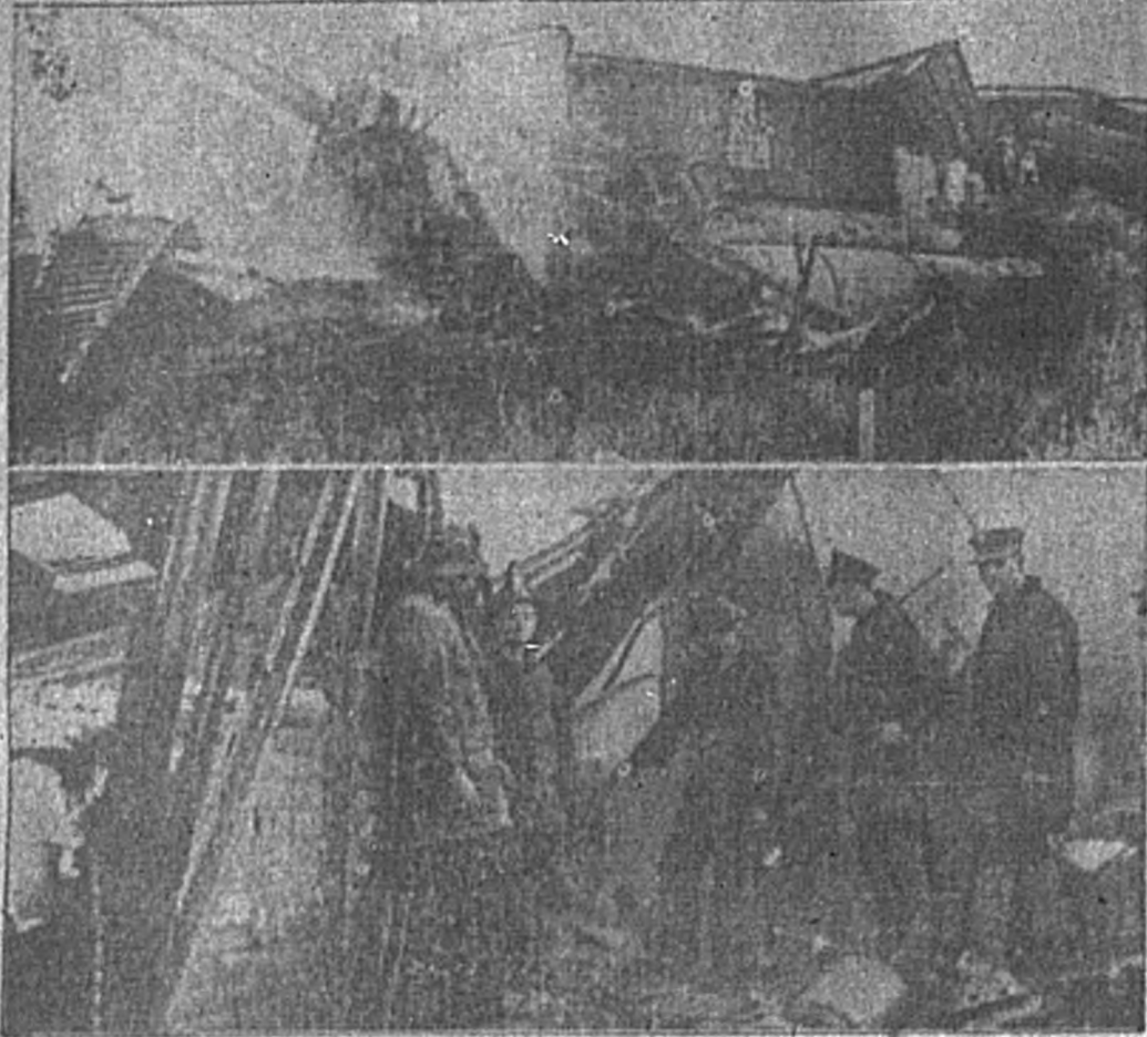
Five persons, and possibly more, met d.e.h. when an Illinois Central freight train was derailed and burned near Monroe, La. The top picture shows a general view of the wreckage and at the bottom firemen are seen examining one of the fifteen derailed cars after they had extinguished the flames.