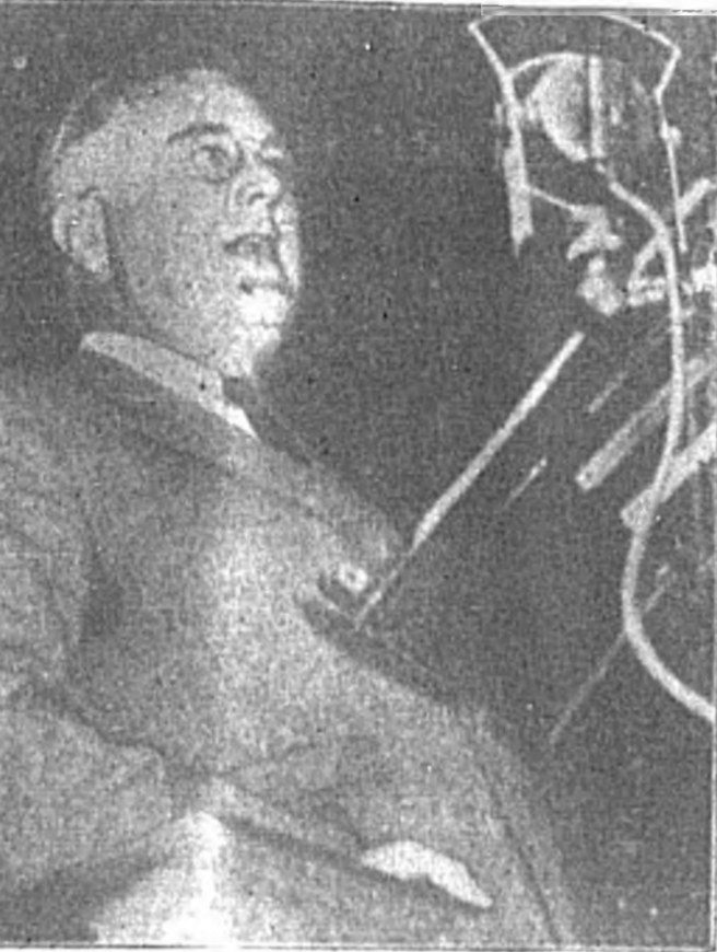
Believing that the federal government should take over the responsibility of the processes of government moving forward with speed.