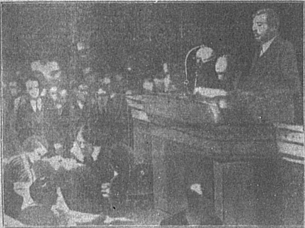
This radio photo shows Premier Pierre Laval of France delivering his momentous speech to the League of Nations at Geneva. He took the stand with Great Britain in defense of the peace obligations of the League Covenant. His speech was followed by announcements that Canada, Soviet Russia, the Little Entente, the Balkan Entente, the Baltic states, and other European nations would oppose Italy's invasion of Ethiopia. Italian police guarded the French embassy at Rome to prevent possible demonstrations resulting from Laval's speech.