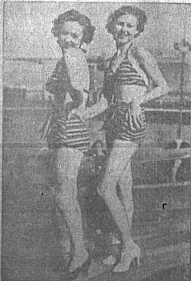
Those who believed about all stripes and colors of bathing suits had already been invented might take a look at these two young ladies. They were inspired by a color, so to be original all on the line of zebra for a model—and hence the result. The swimsuits are by the designer (R.P.) and they are shown on the sands of Santa Monica, Calif.