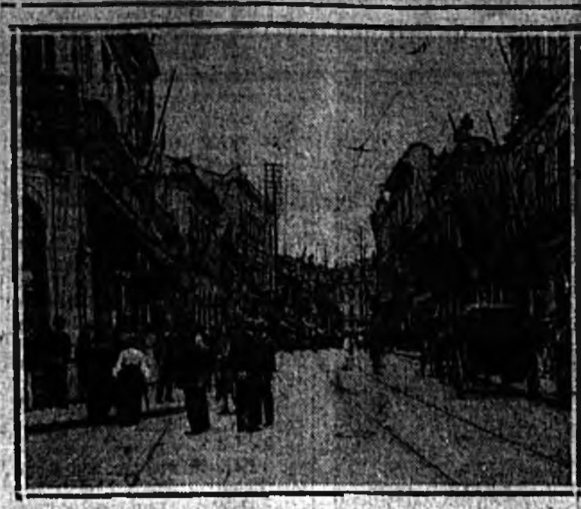
Here is a view of one of the principal business thoroughfares in the city of Sao Paulo, capital of the state of Sao Paulo, Brazil. Rebels remain in control of the town.