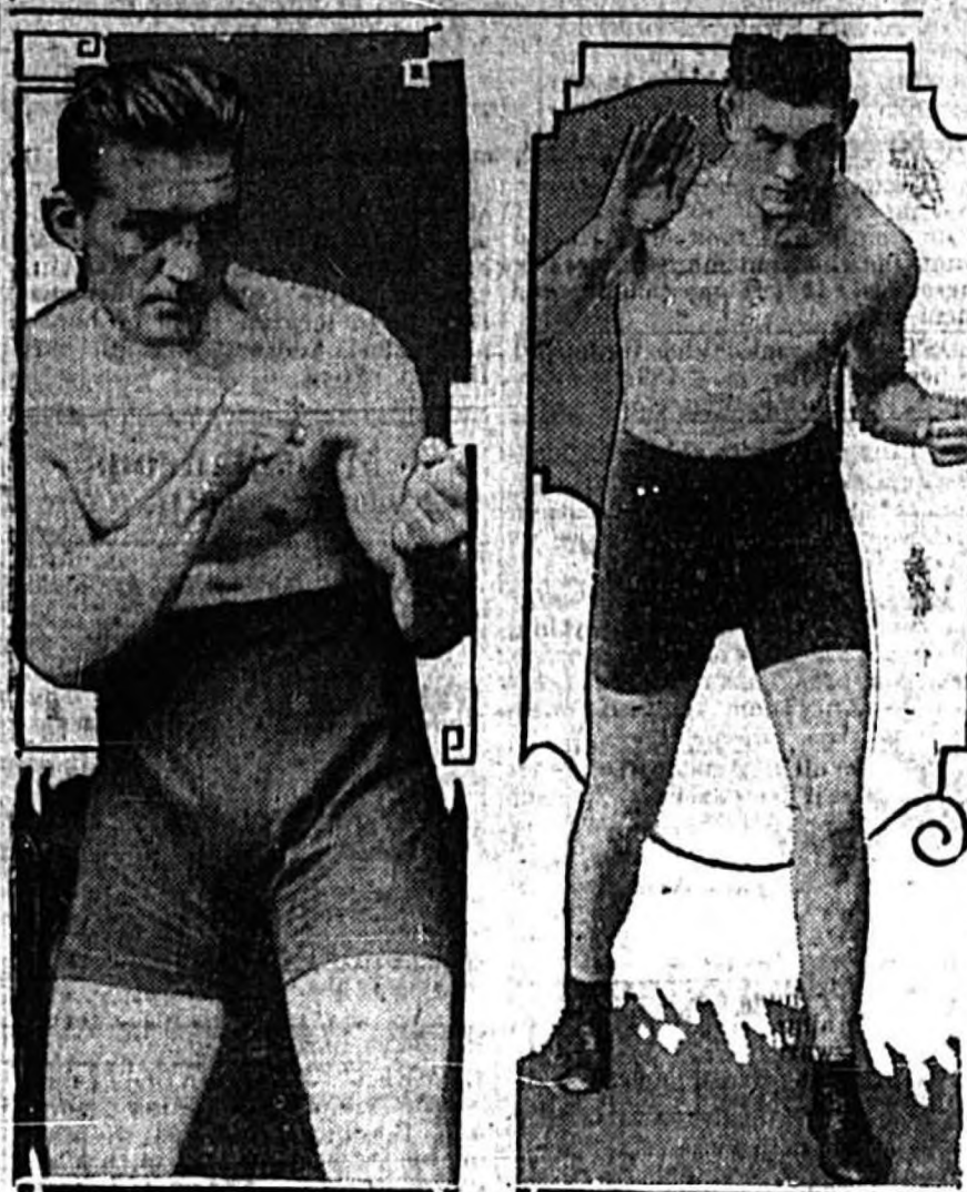
The light heavyweight championship of America will be at stake when Gene Tunney, the holder, battles Georges Carpentier, the colorful Frenchman, at the Polo Grounds, New York, July 24. Both were active combatants in the late war. Tunney with the A. E. F. and Carpentier with the French air forces.