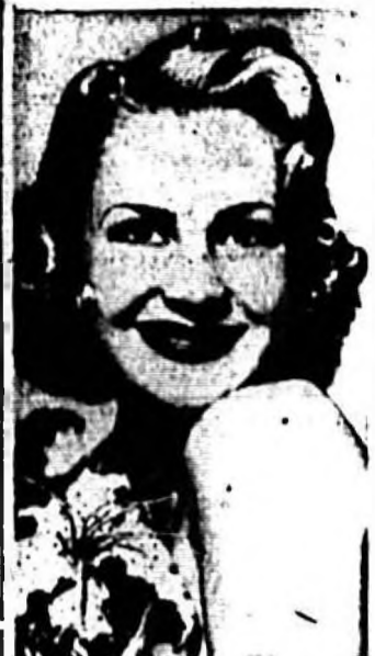
Jackie Coogan, 'The Kid' of the silent movies, now has a kid of his own, Jackie is the father of a baby boy born to the former Flower Fairy in a Los Angeles hospital. Both mother and child are reported doing nicely.