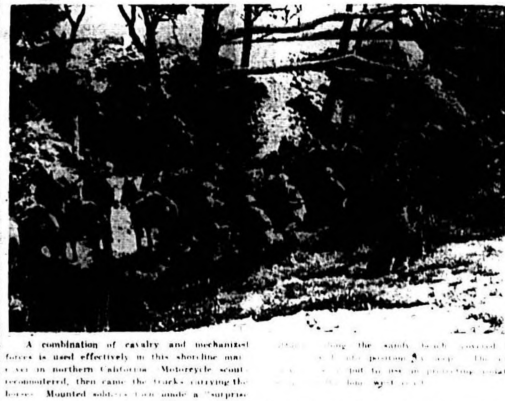
A combination of cavalry and mechanized forces is used effectively in this short-line maneuver in northern California.