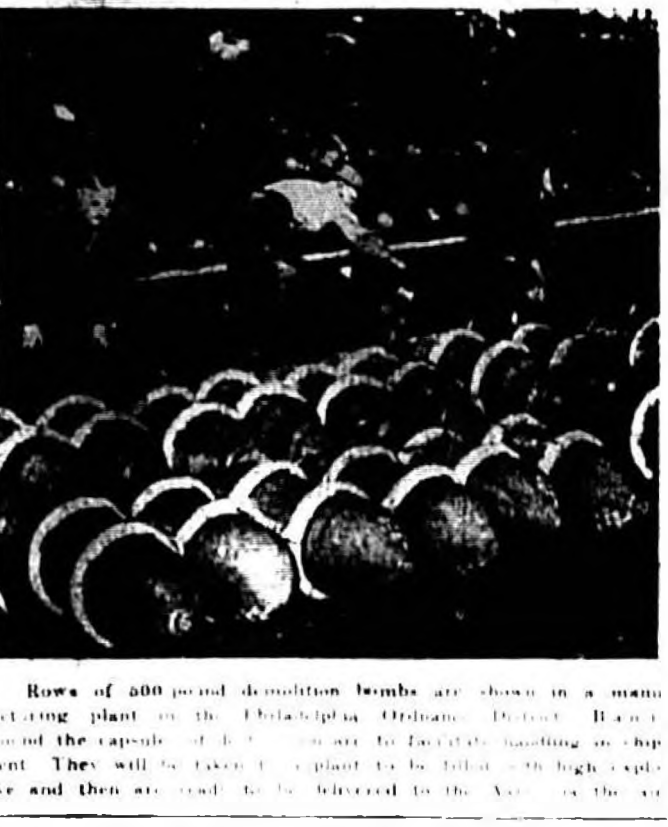
Rows of 600-pound demolition bombs are shown in a munitions plant in the Philadelphia Ordnance District.