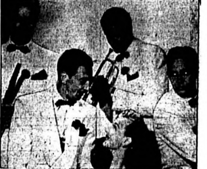
RAY BOLGER and Anne Shirley, featured in "Four Jacks and a Jill," a laugh spangled, song studded, musical comedy romance, coming to the Ritz next Tuesday as part of a double bill program.

Theater Program For Week of Mar. 8 Sunday, Monday—JOHNNY EAGER with Robert Taylor, Lana Turner, Robert Montgomery, Van Heflin, Robert Sterling and Henry O'Neil. Also, Walt Disney cartoon, "Chief Duck." Tuesday, Wednesday—Double feature, "THE LETTER" with Bette Davis and Herbert Marshall. Also, "FOUR JACKS AND A JILL" with Ray Bolger and Anne Shirley. Wednesday, Thursday—Benefit shows for Junior Auxiliary—"LOOK WHO'S LAUGHING" with Edgar Bergen, Charlie McCarthy, Fibber McGee and Molly and Lucille Ball. Also, four live features. Friday, Saturday—"THE SMILING GHOST" with Wayne Morris, Brenda Marshall and Alexis Smith. Also, "DEATH VALLEY OUTLAWS" with Don "Red" Barry and Lynn Merrick.