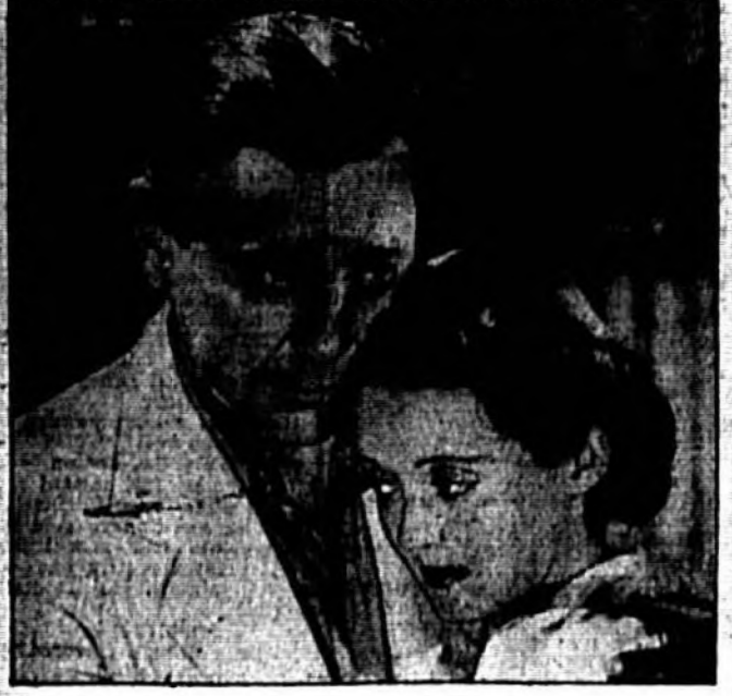
LOVERS of the better class of film will welcome the showing next Tuesday at the local Ritz Theater of "The Letter," great drama starring Bette Davis and Herbert Marshall.