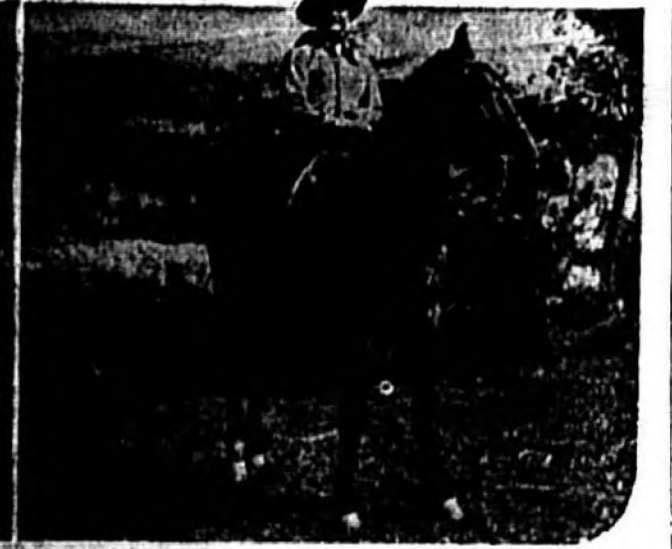
DON "RED" BARRY goes again in his newest action thriller, "Death Valley Outlaws," a real treat for western fans, coming to the Ritz next Friday and Saturday.