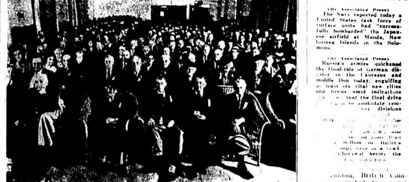
Pictured above are 92 early residents of Seminole County who attended the eightieth annual pioneer celebration in New Year's week.