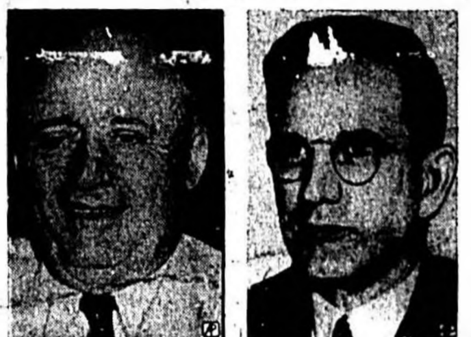
House of Representatives Speaker Sam Rayburn of Texas (left) who was re-elected to that post and Rep. John W. McCormack of Massachusetts who was re-elected majority leader as the Democrats go together with the hope that their control over the chamber will not be jeopardized by the strengthened Republican bloc.