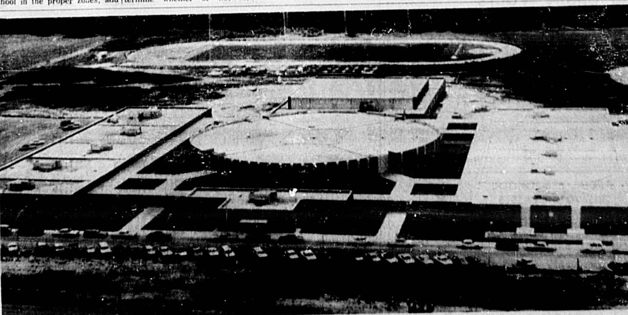
ATHLETIC PLANT at Lyman High School is beginning to take shape. Oval at top of photo is for field and track events, with football games in the center. Preparations are being made to construct spectator stands.