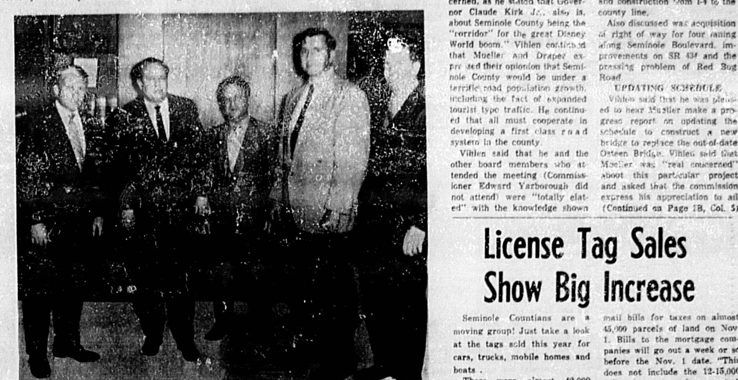
THE SUBJECT WAS ROADS, ROADS, ROADS. EDWARD MUELLER, secretary of the State Department of Transportation...