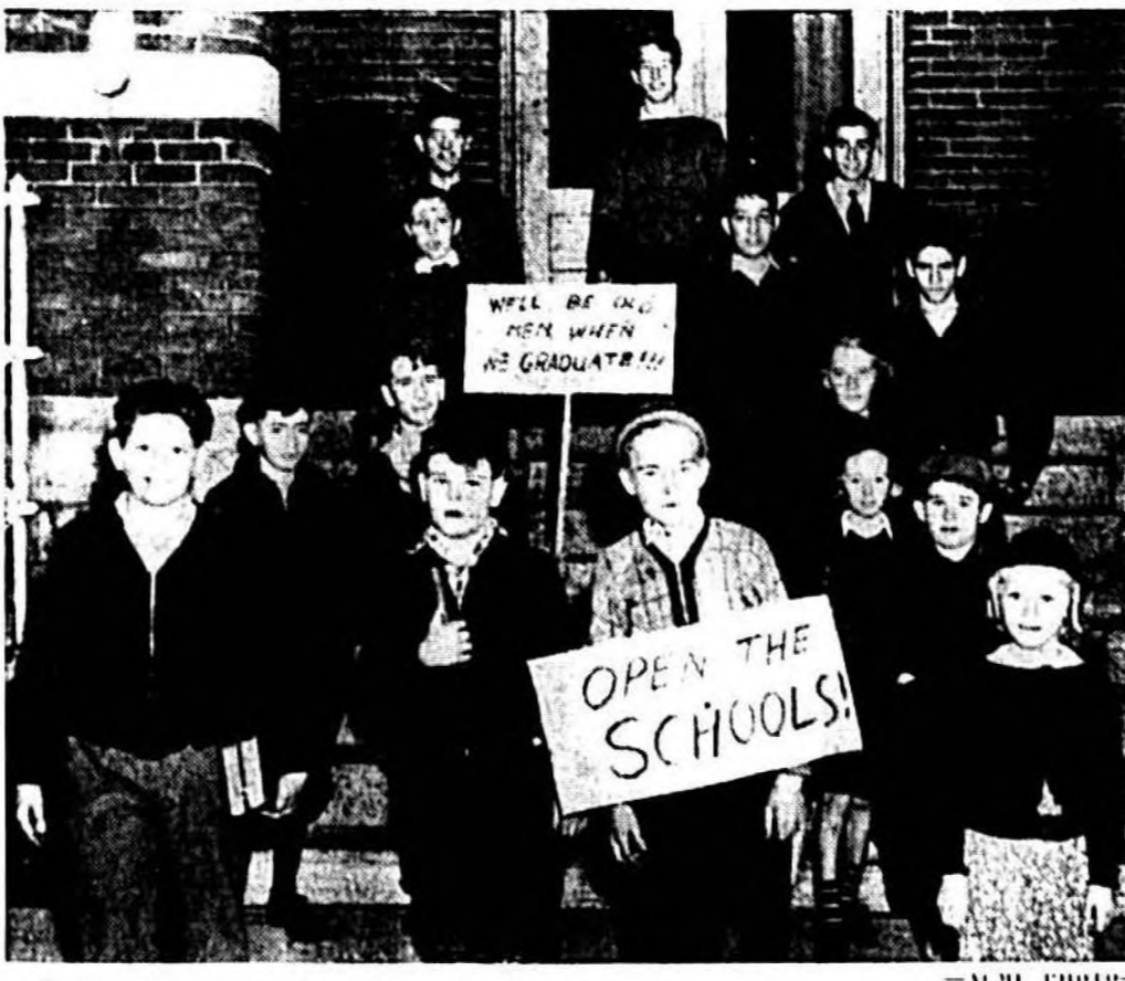
A temporary court order prevents the Daytona, O., Board of Education from vacating its plan to close the schools for an indefinite period. Children and their mothers were affected by the order. Pictured above are children leaving one of Daytona schools Friday carrying protest signs.