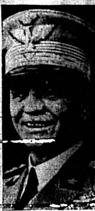
Marshal Pietro Badoglio, second to Mussolini himself in commanding Italy's army.

A friend of mine tells the yarn about the theater manager, whose business was very good during the summer and Fall, but who found it dropped to almost nothing in January and February.